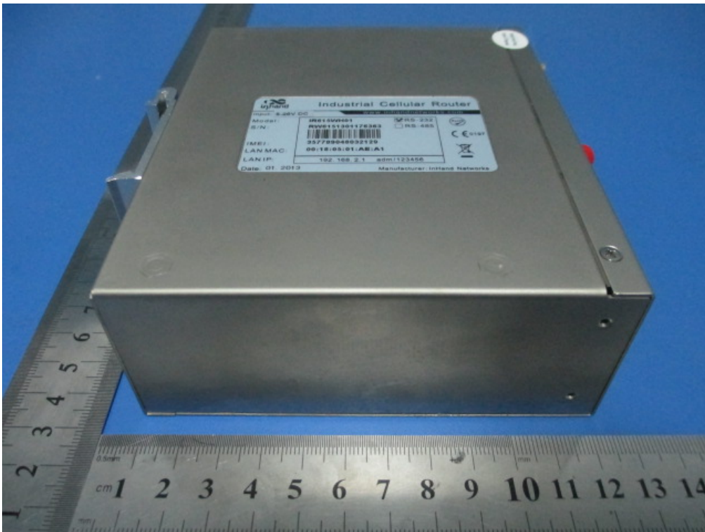
Left View of EUT