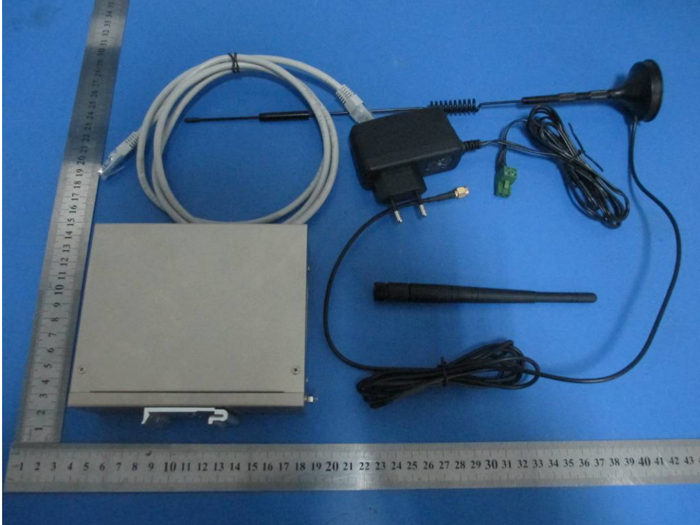
Whole Package View