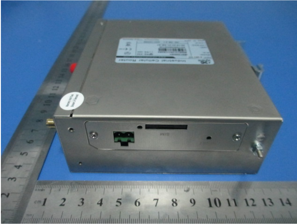
Right View of EUT

Report No: 13020108-4-FCC-E1-V1 Issue Date: March 20, 2013 Page: 22 of 33 www.siemic.com.cn