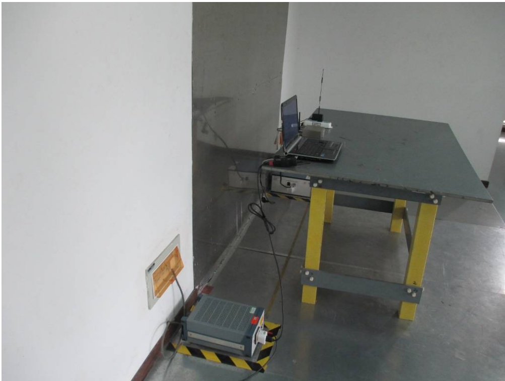
Conducted Emissions Test Setup - Side View