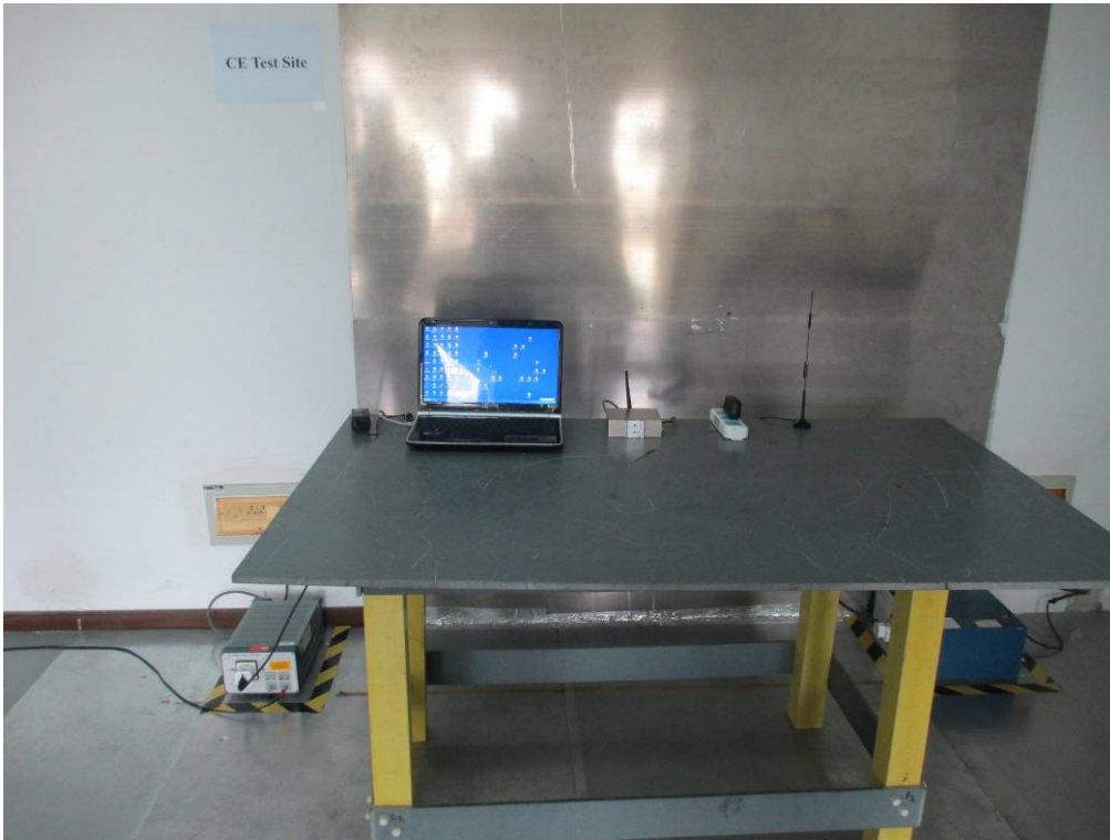
Conducted Emissions Test Setup - Front View