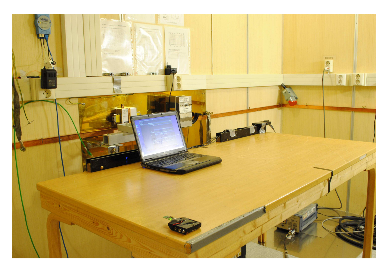
Power line Conducted Emissions Test