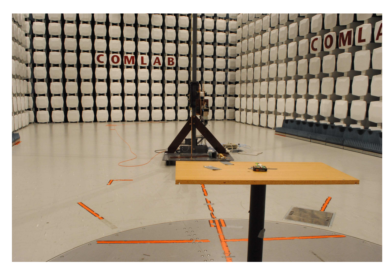
Radiated Emissions 1 - 12 GHz