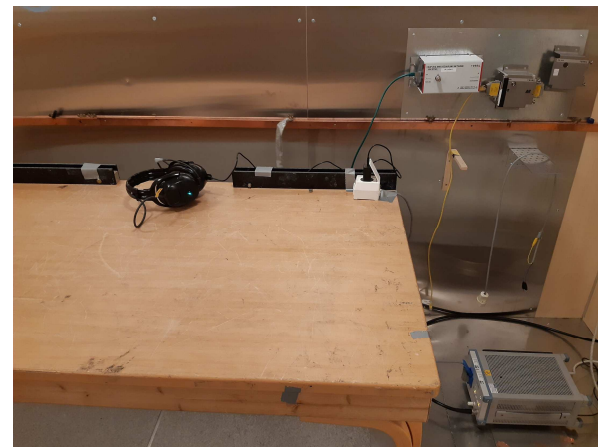
Power-Line Conducted Emissions