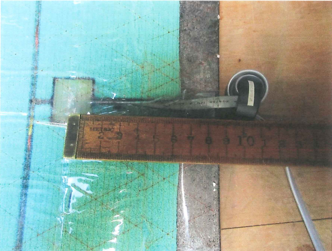
Figure A1: FAIR-RITE Part# 2643866402 Ferrite on Antenna Cable (4 Passes) – View 1