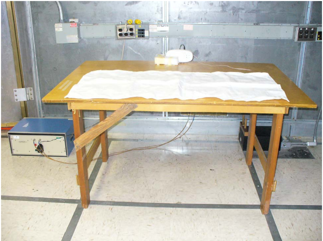
Figure 8: Power Line Conducted Emissions – Front View