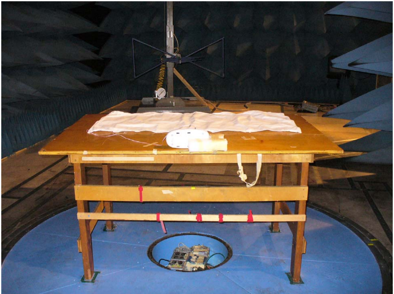
Figure 3: Radiated Emissions – Back View 1