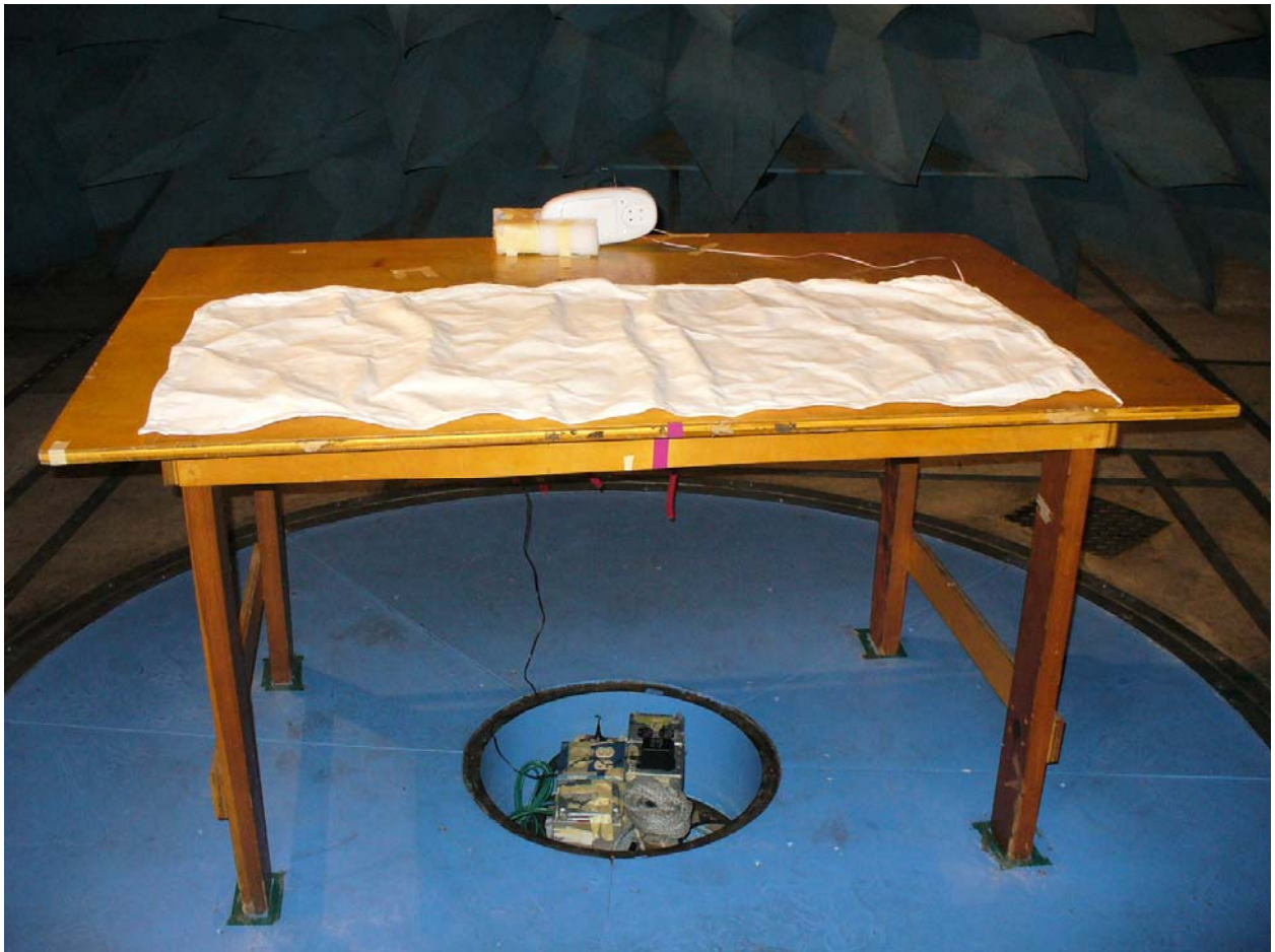
Figure 2: Radiated Emissions – Front View with Charger