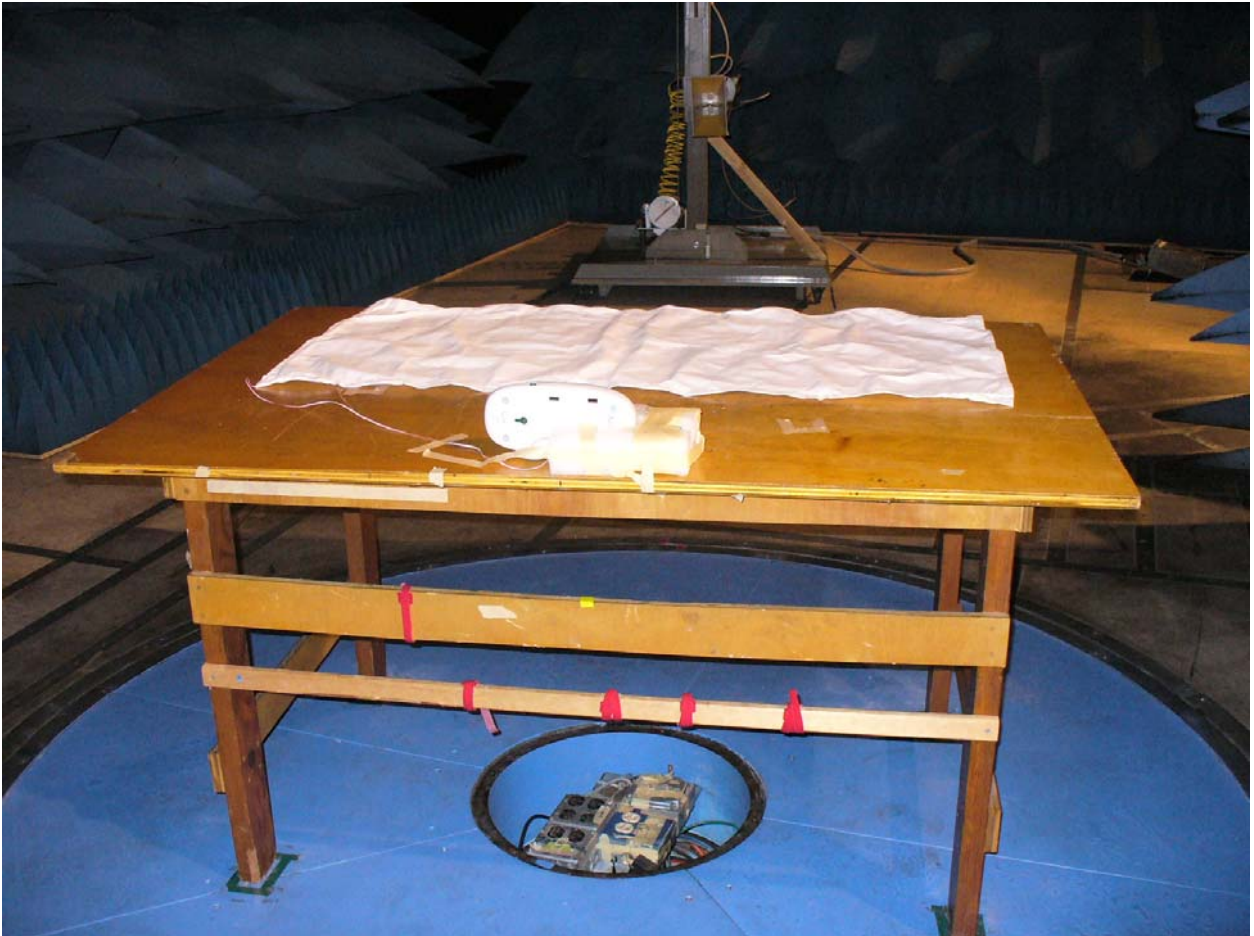
Figure 4: Radiated Emissions – Back View 2