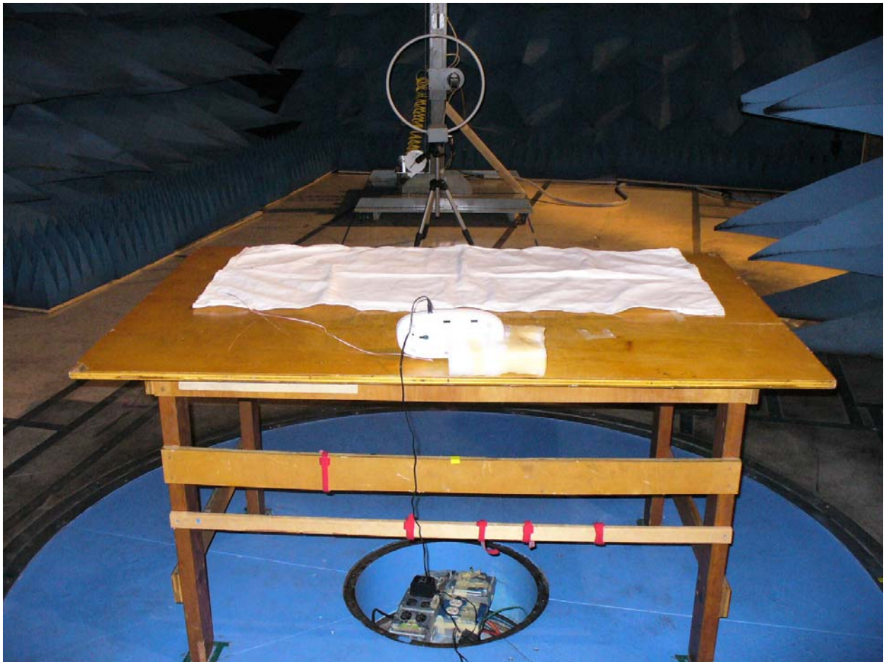
Figure 6: Radiated Emissions – Back View 1 with Charger