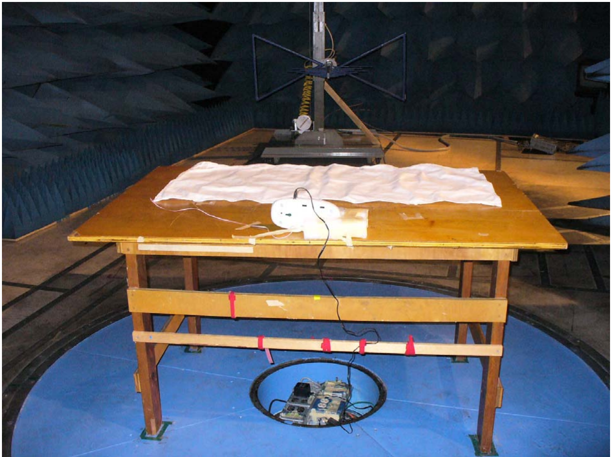
Figure 7: Radiated Emissions – Back View 2 with Charger