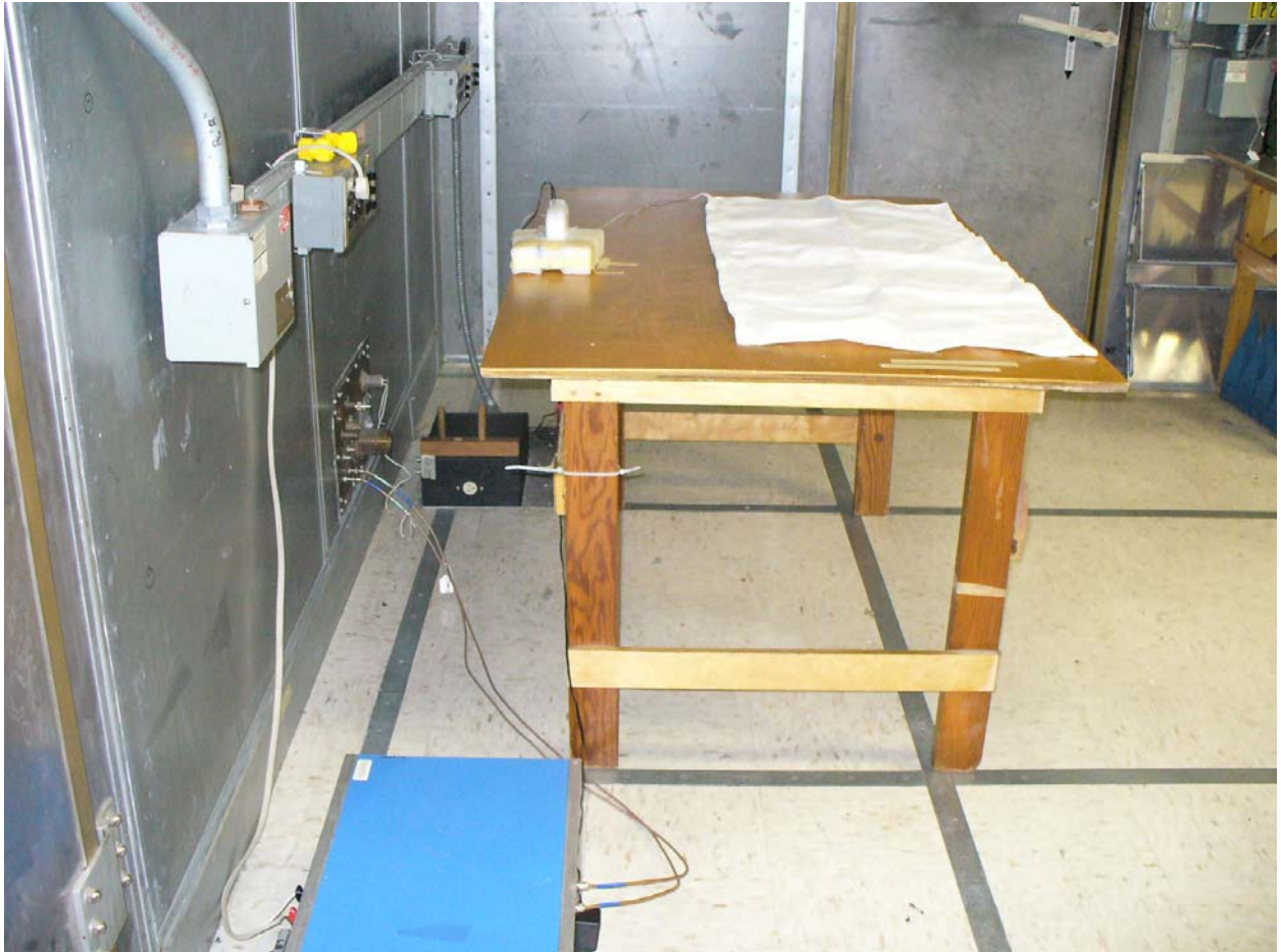
Figure 9: Power Line Conducted Emissions – Side View