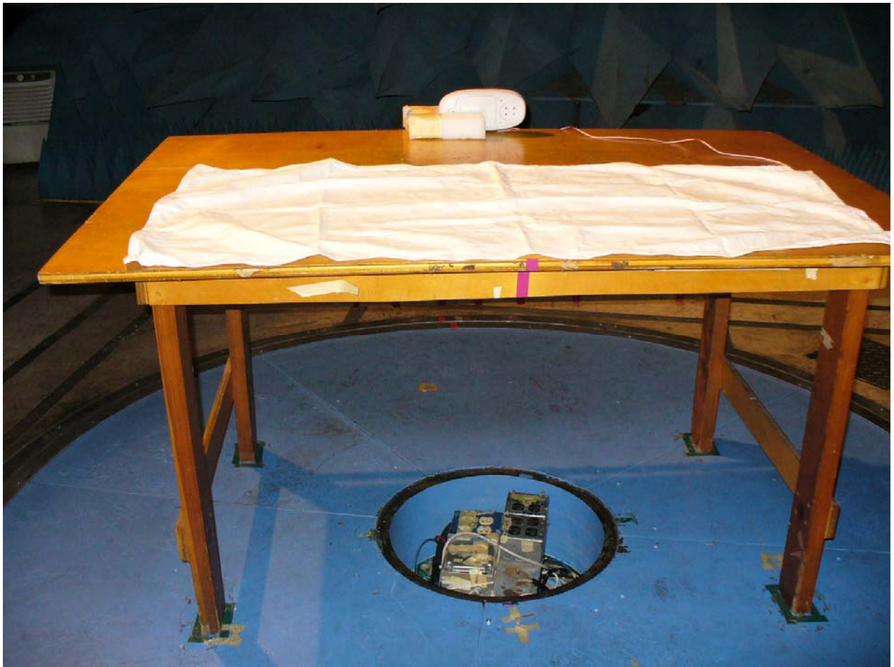
Figure 1: Radiated Emissions – Front View