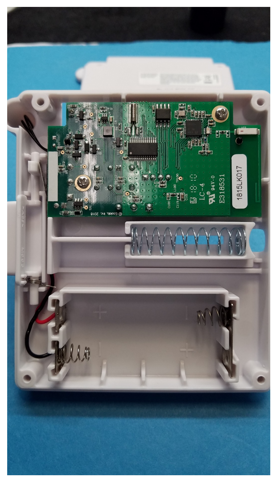
Figure 3: Assembled View