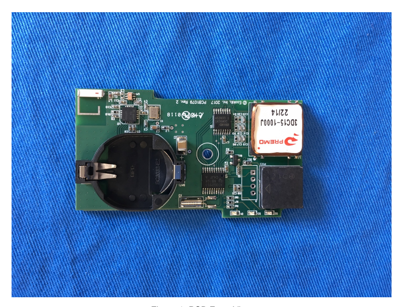
Figure 1: PCB Front View