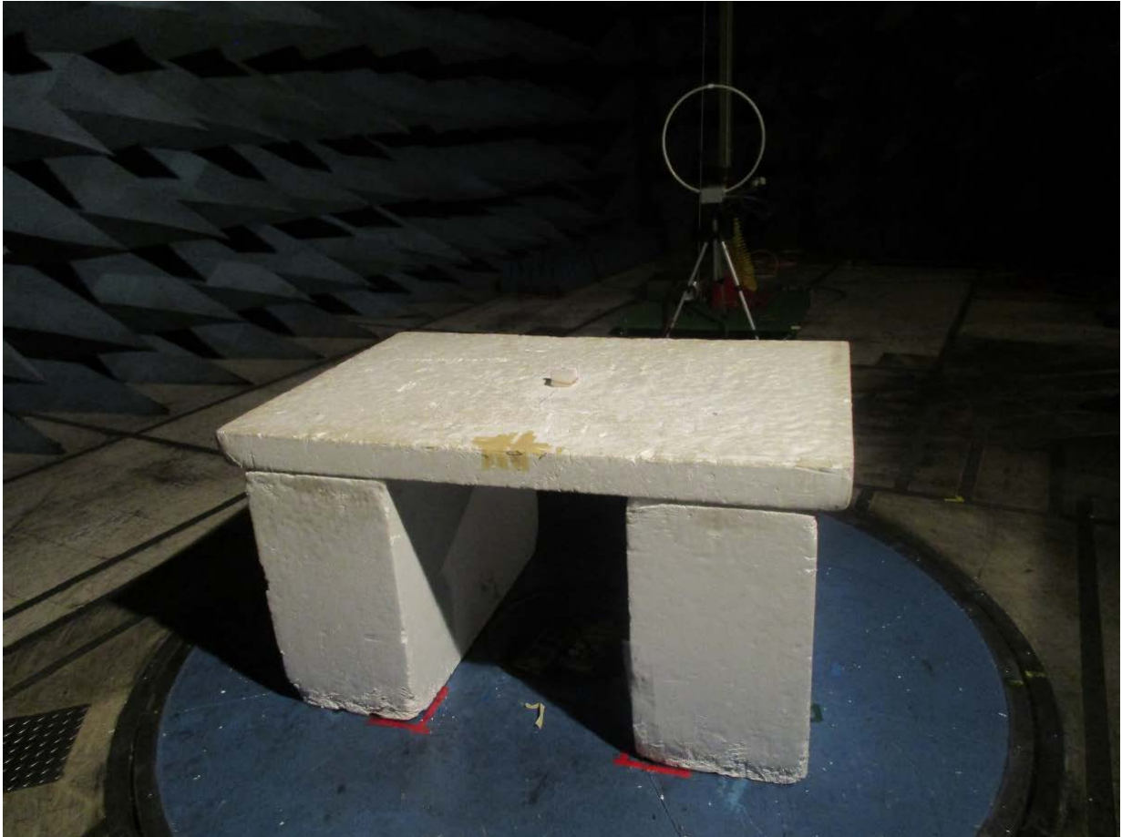
Figure 1: Radiated Emissions – EUT Standing – below 30 MHz