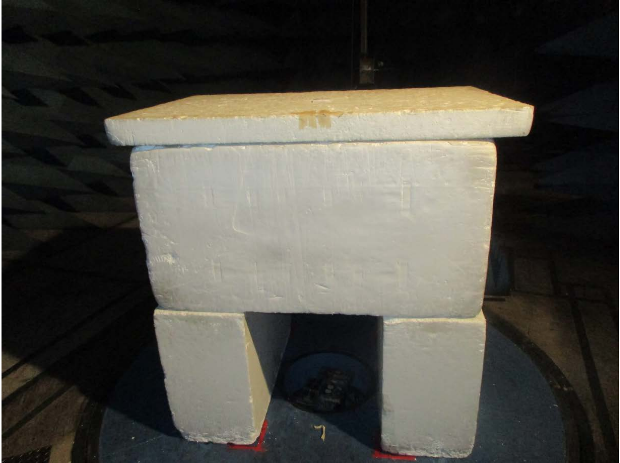
Figure 5: Radiated Emissions – EUT Flat – above 1 GHz