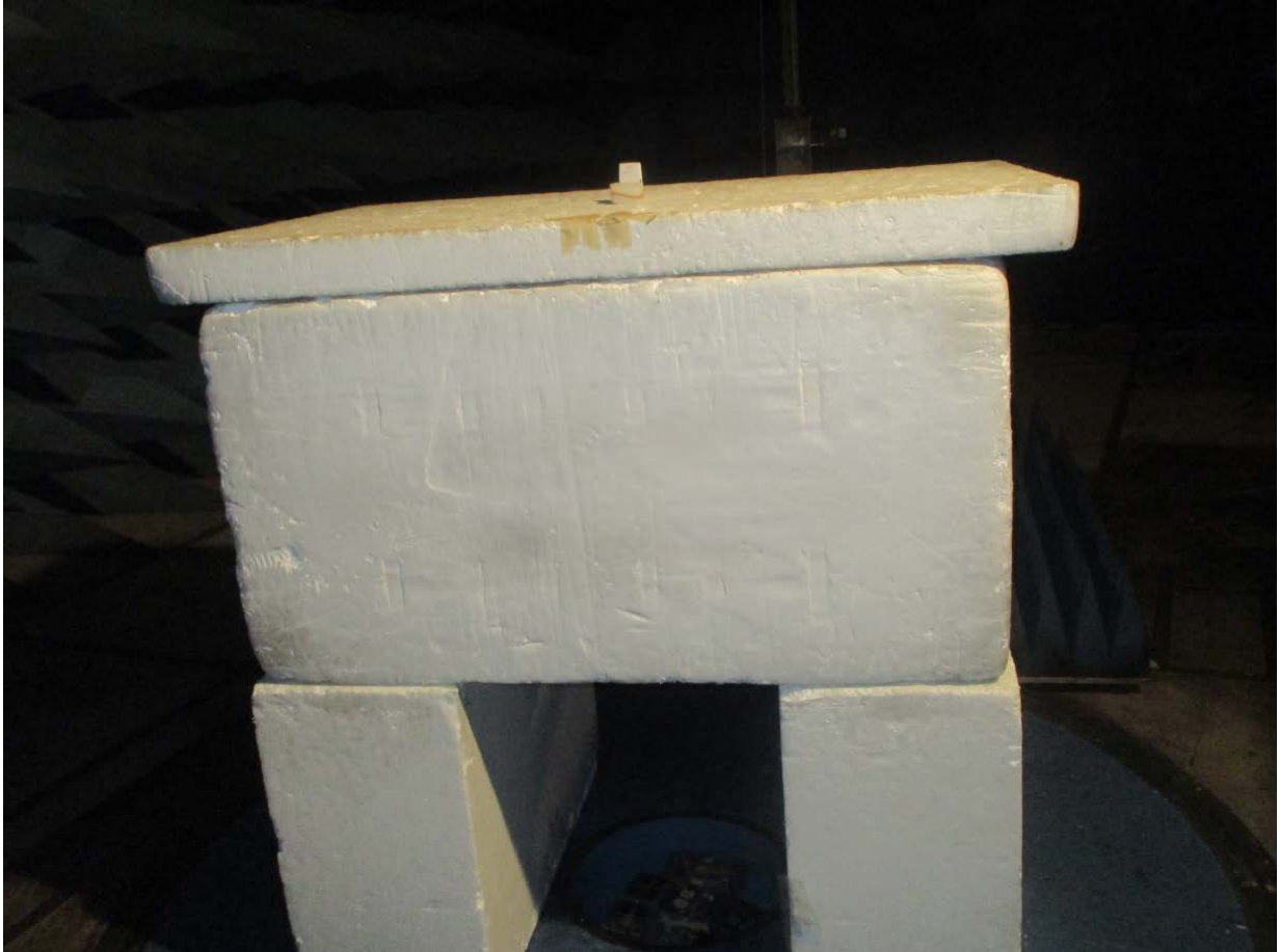
Figure 6: Radiated Emissions – EUT on Side – above 1 GHz