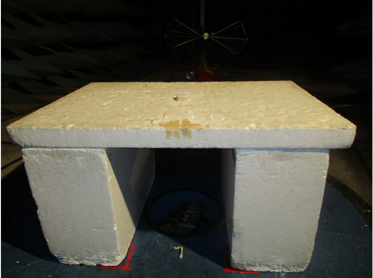
Figure 2: Radiated Emissions – EUT Standing – 30 MHz – 200 MHz