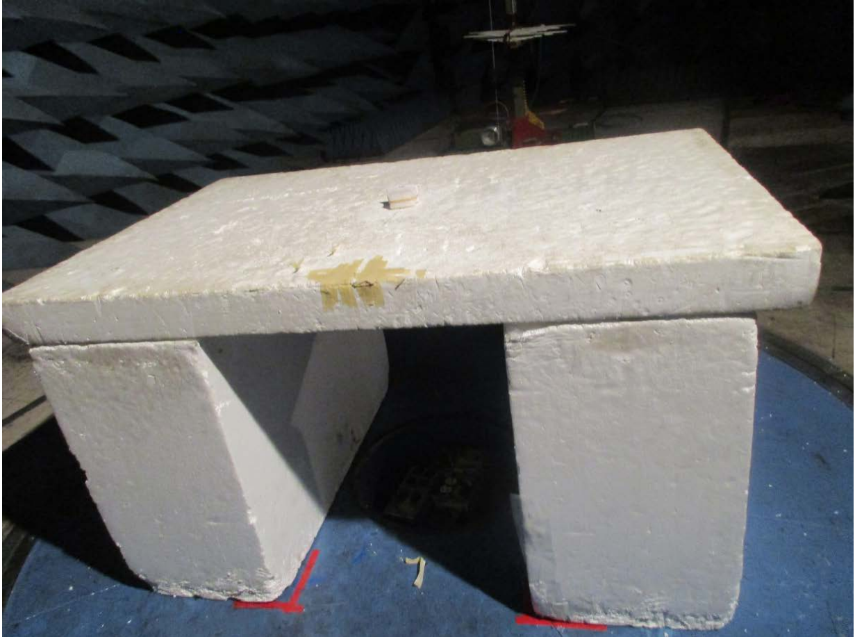
Figure 3: Radiated Emissions – EUT Standing – 200 MHz – 1 GHz