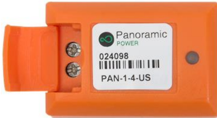
PAN 14 Current Sensor

This user guide explains how to install the PAN-14 sensors.