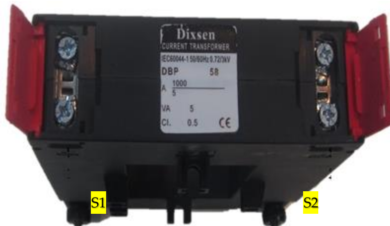
Current Transformer (CT)