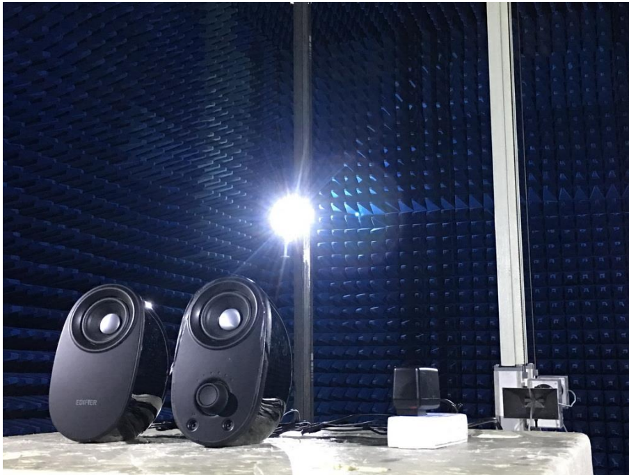
Radiated Spurious Emission Above 1GHz