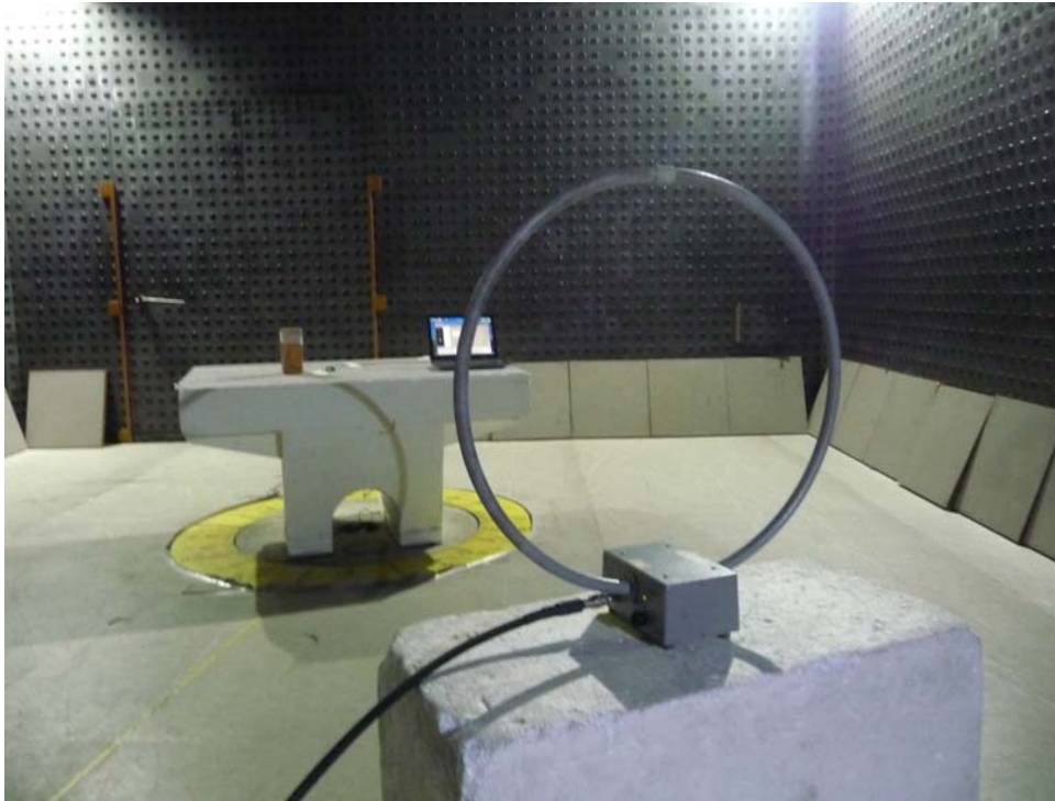
Photograph No.1 Setup for fundamental and spurious emission field strength measurements in the anechoic chamber below 30 MHz