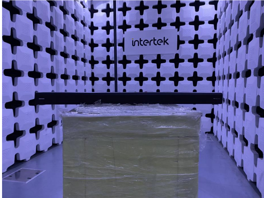
Back View (Above 1GHz)