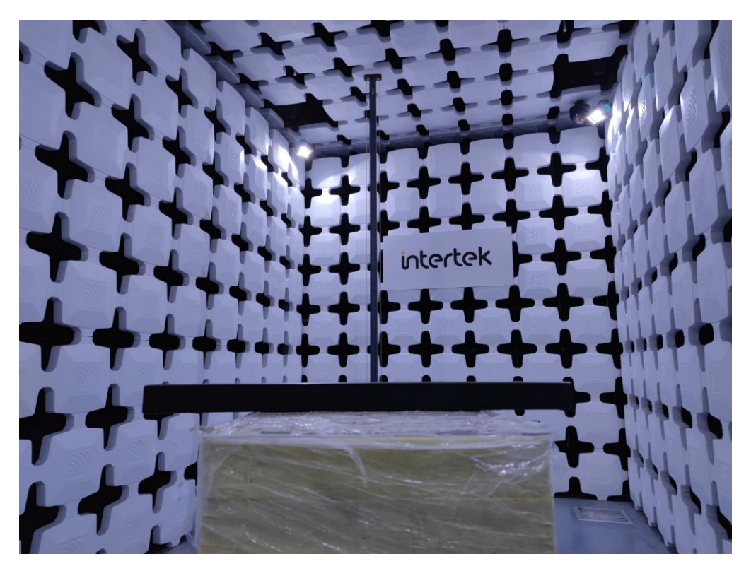
Radiated photo above 1GHz