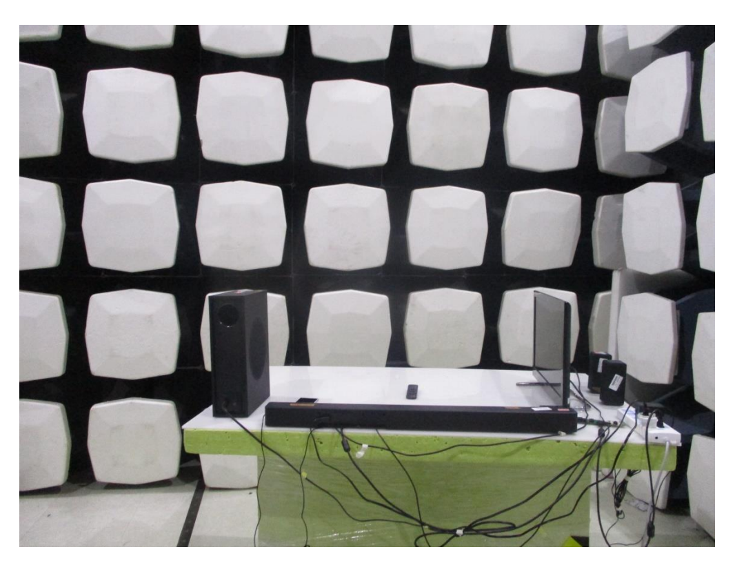
Radiated photo up to 1GHz