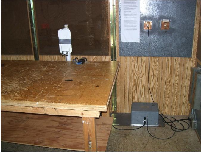
AC line conducted