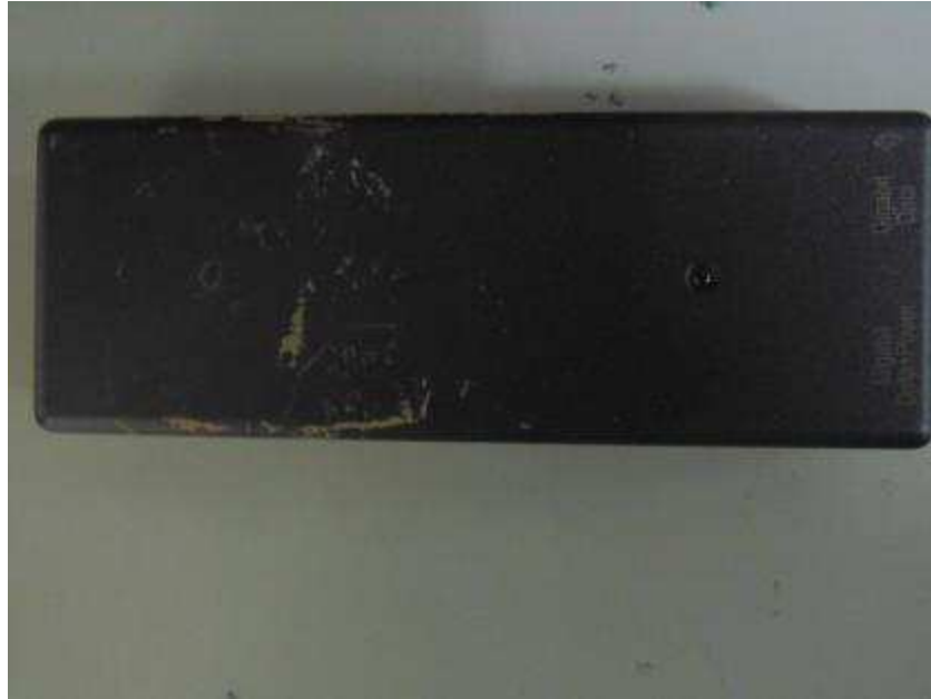
Figure 7: Photograph of the AC Adapter top view