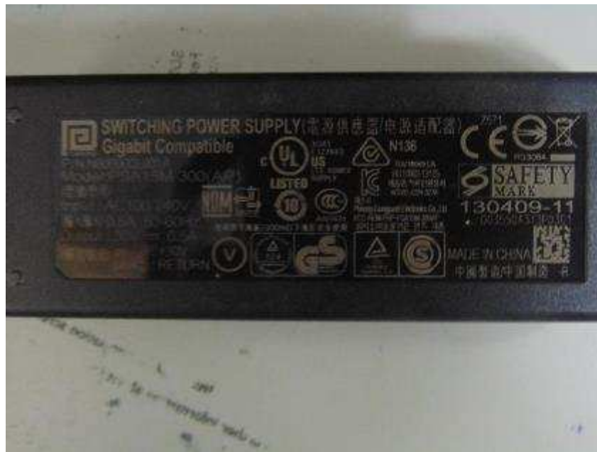
Figure 6: Photograph of the AC Adapter showing model no