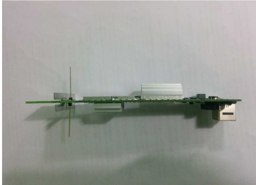
Figure 3: Photograph of the EUT with Dipole Antenna