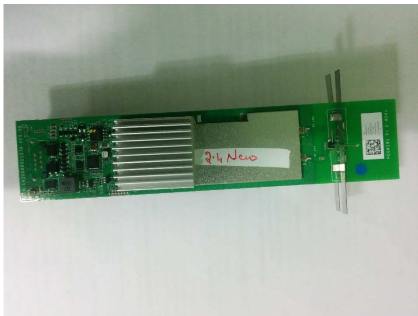
Figure 2: Photograph of the EUT – Bottom Side