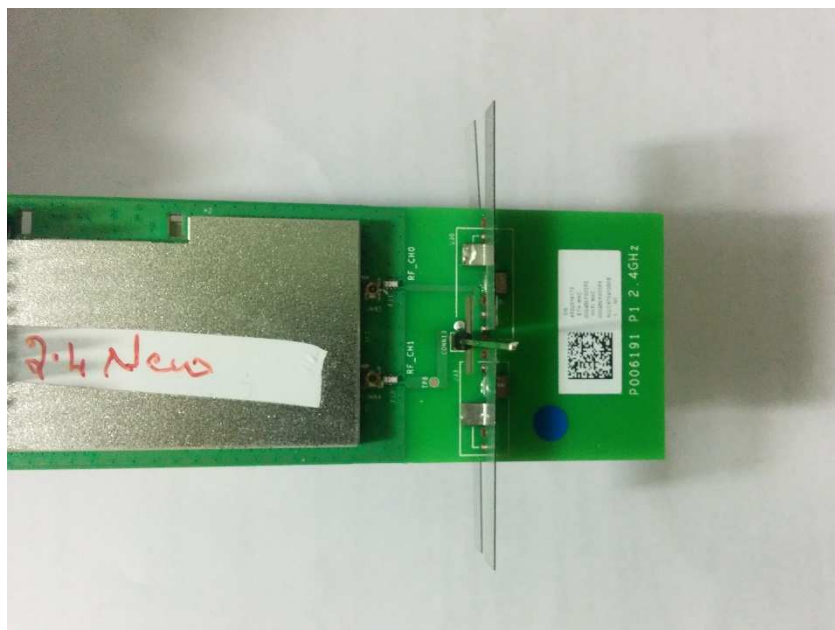
Figure 4: Photograph of Serial number of product used for Conducted tests