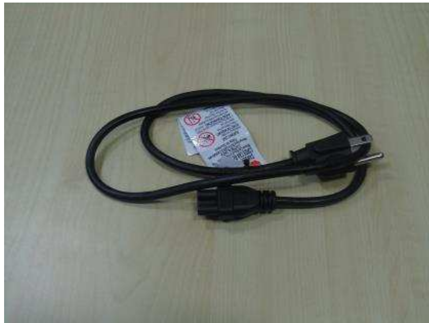
Figure 8: Photograph of the AC Adapter Power cord