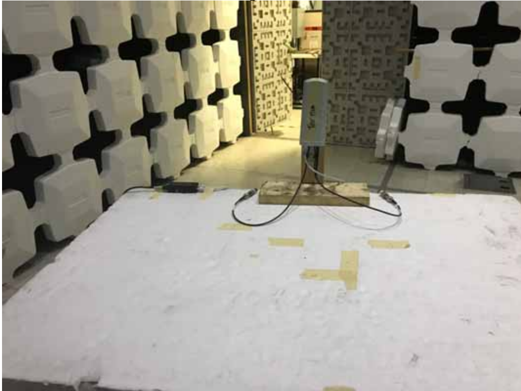
Photograph of the EUT