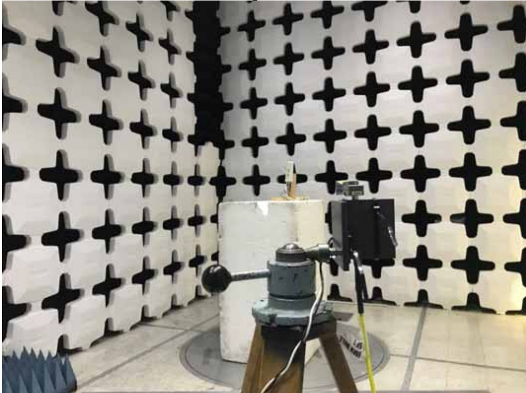
Test Setup for Radiated Emissions above 18-26GHz – Horizontal Polarization