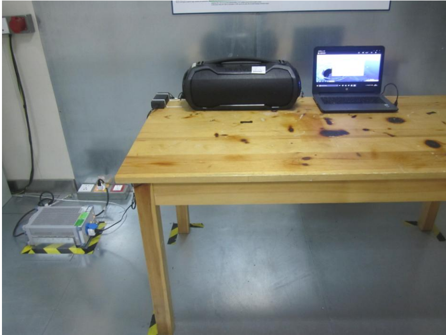
DSS&DTS radiation L