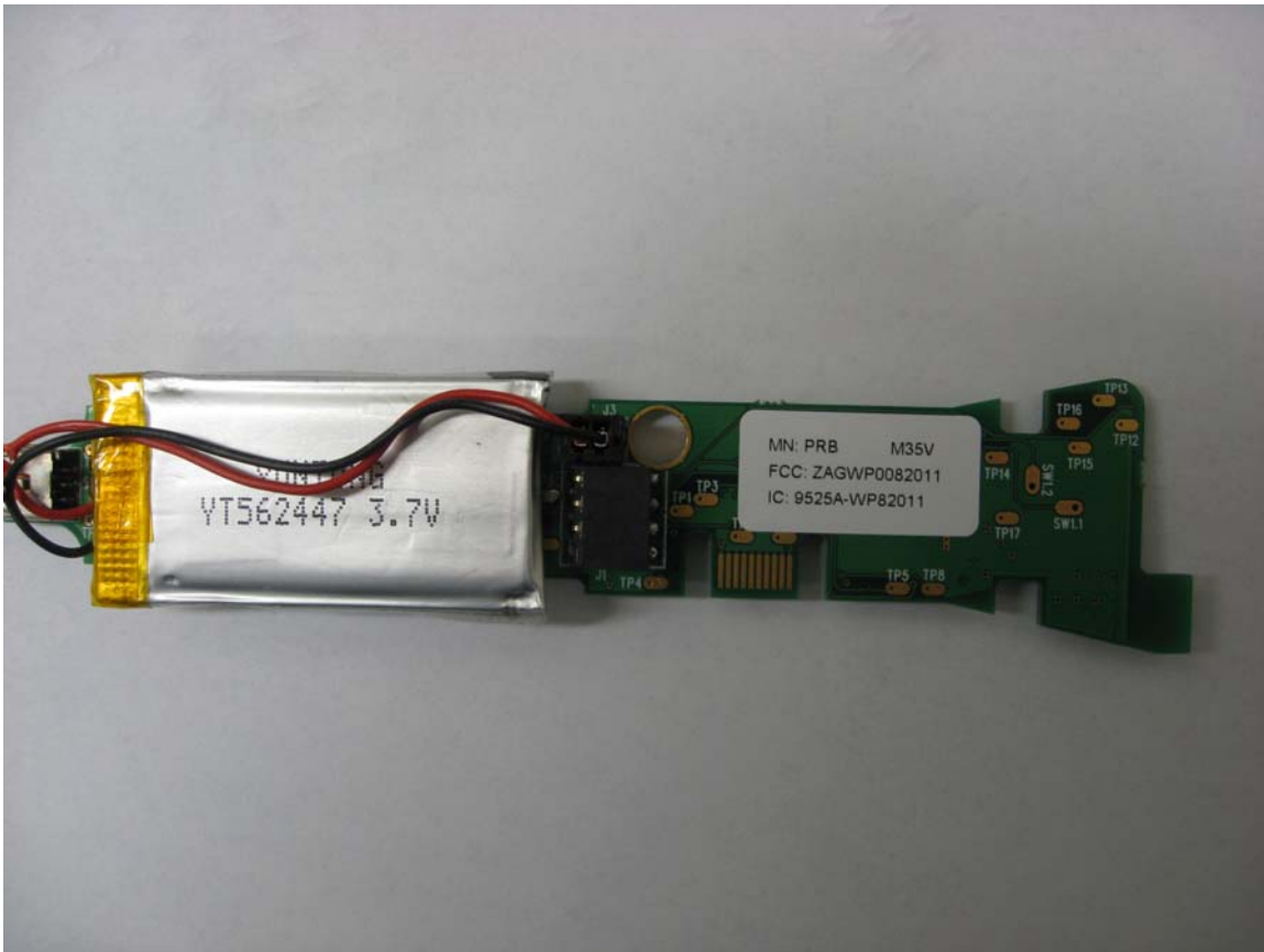
Location of Label on Module

Note that the lettering on the photo is not the final letters used. The drawing on page 1 of this document shows the final wording. This is the final location.