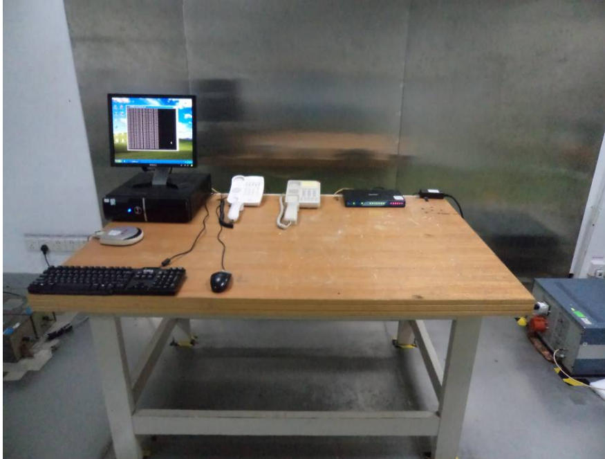
Conducted Emissions – Side View