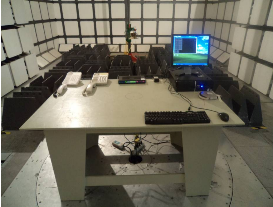
Radiated Emissions – Rear View (1-5 GHz)