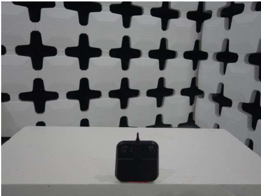
Up to 1GHz (The EuT placed at the center of the turntable)