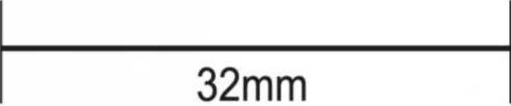
SIZE: 32mm (W) x 16mm (H)