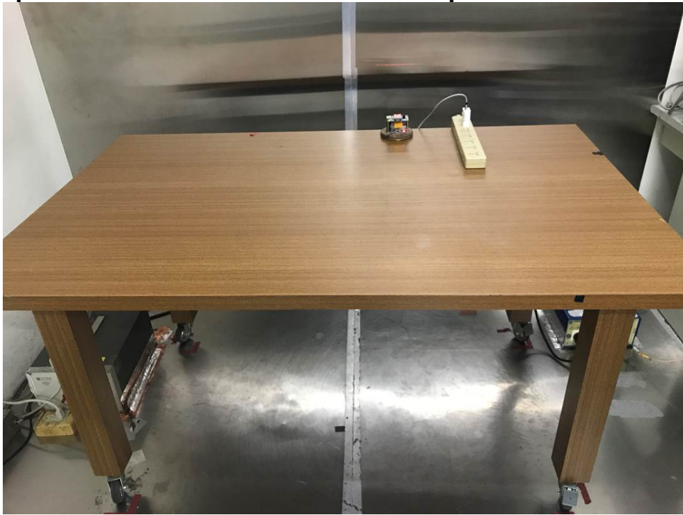
Photograph –Conduction Emission Test Setup