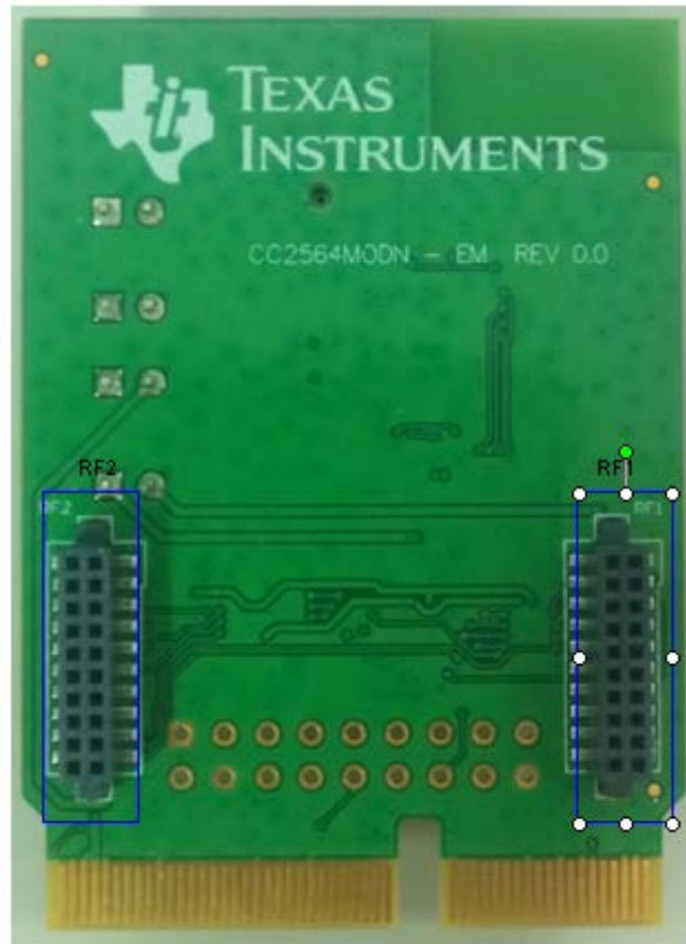
Figure2. Bottom view of CC2564MODNEM