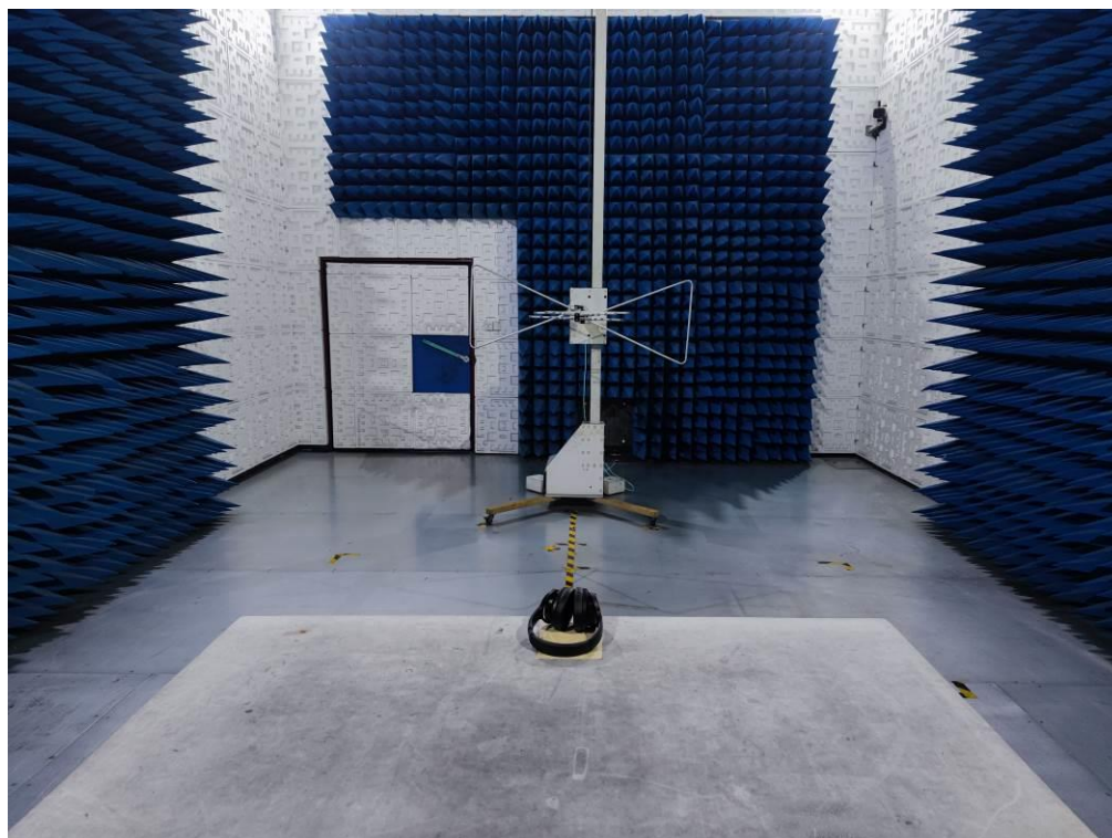
RADIATED EMISSION TEST SETUP ABOVE 1GHz