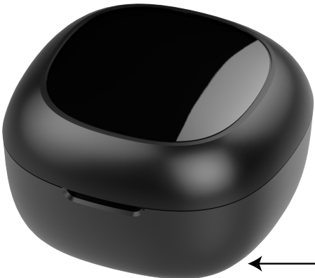
silk-screen to the bottom of the charging box

The location of the Bluetooth earphone is too small and can not mark the FCC ID number. During production, the FCC ID number should be mark at the bottom of the charging box and user manual. If the charging case is lost or damaged, the Bluetooth earphone cannot be charging and Use.