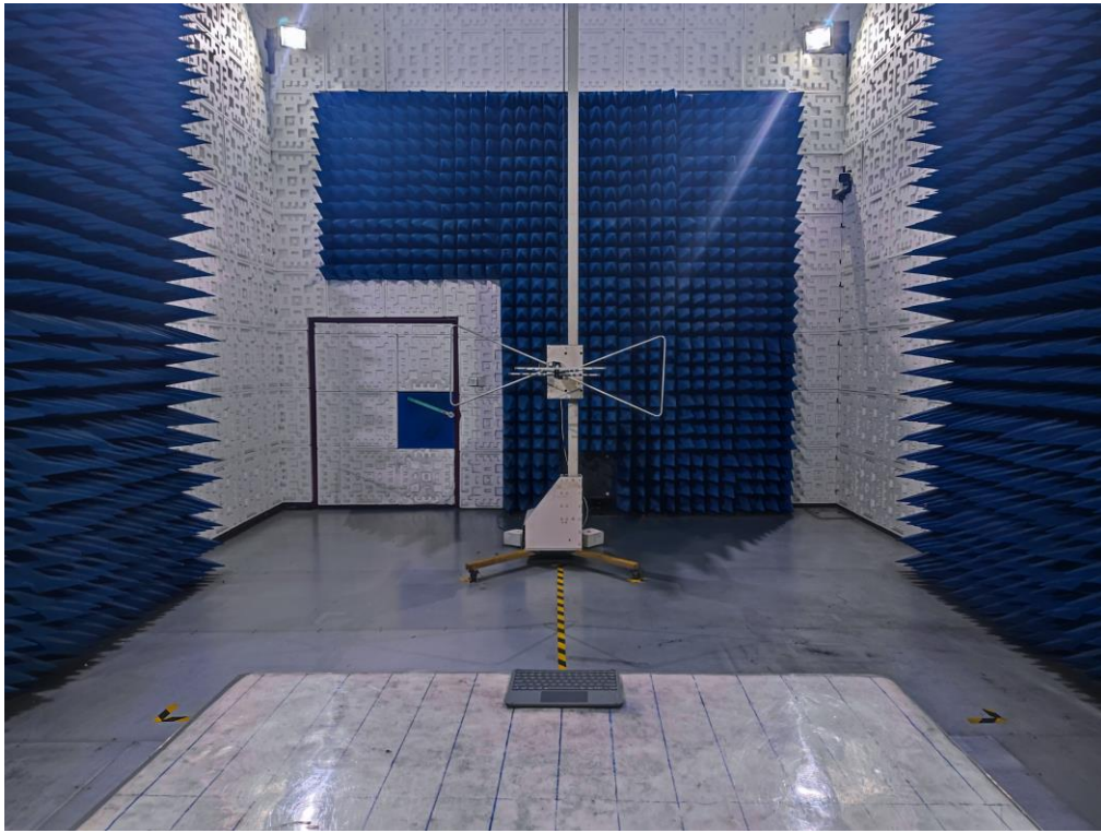
RADIATED EMISSION TEST SETUP ABOVE 1GHz