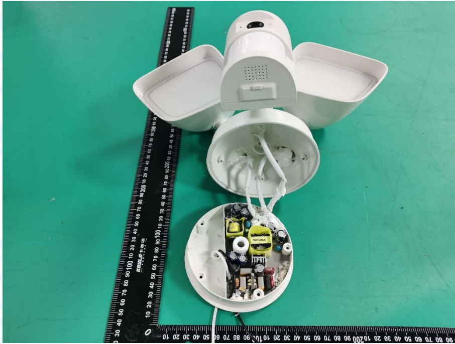
Photo 8 Appearance of EUT