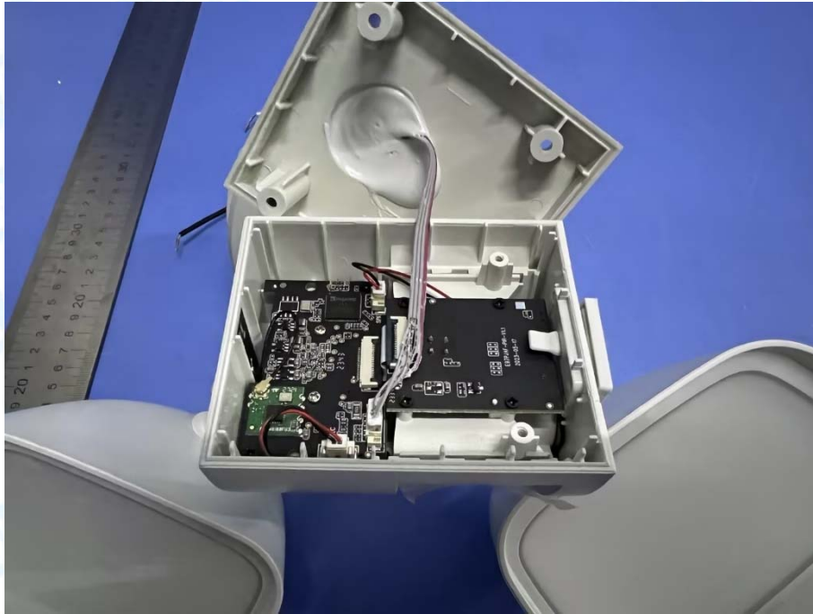
Photo 10 Appearance of PCB