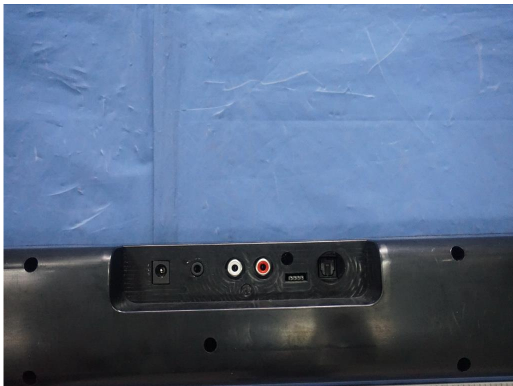
Fig. 4: External view