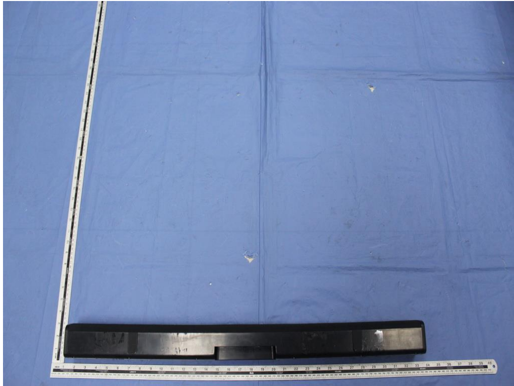
Fig. 3: External view

Type Designation: SB20 Report Number: 50049995 001