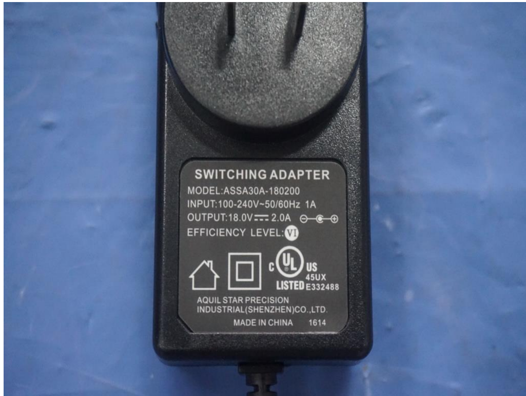
Fig. 5: External view

Type Designation: SB20 Report Number: 50049995 001