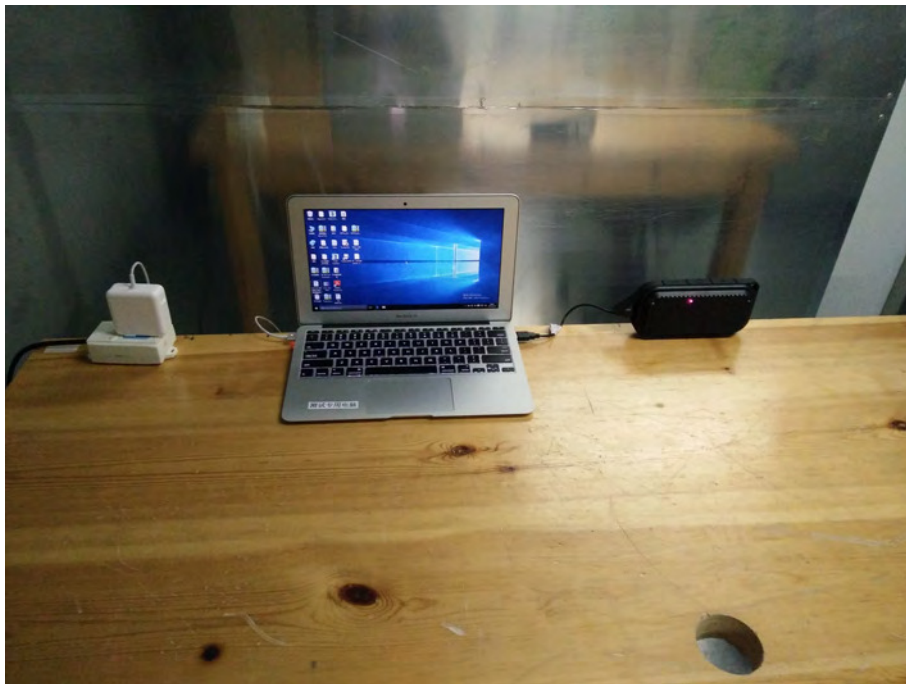
Conducted Emission Test 1