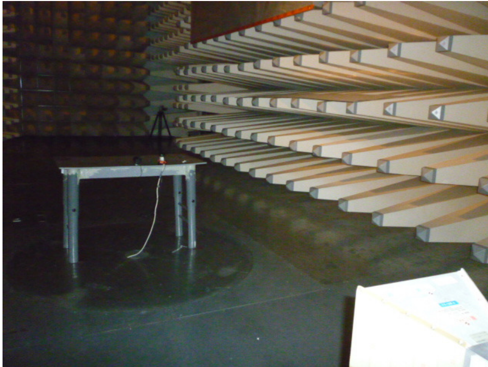
Set-up for Radiated Emission