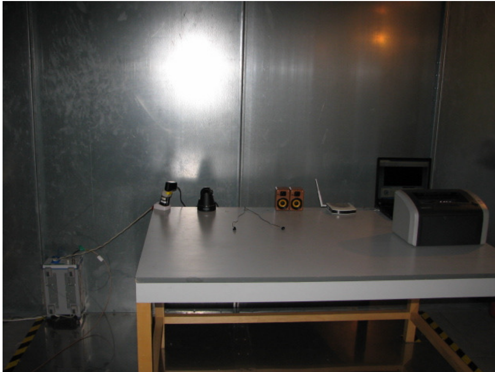
Disturbance Voltage on AC Mains