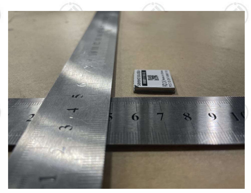
View of Product-9

Page 39 of 42 Report No.: EED32O80763101