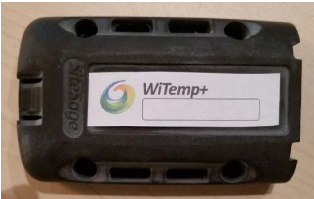
Fig 15, Bottom assembly showing product label