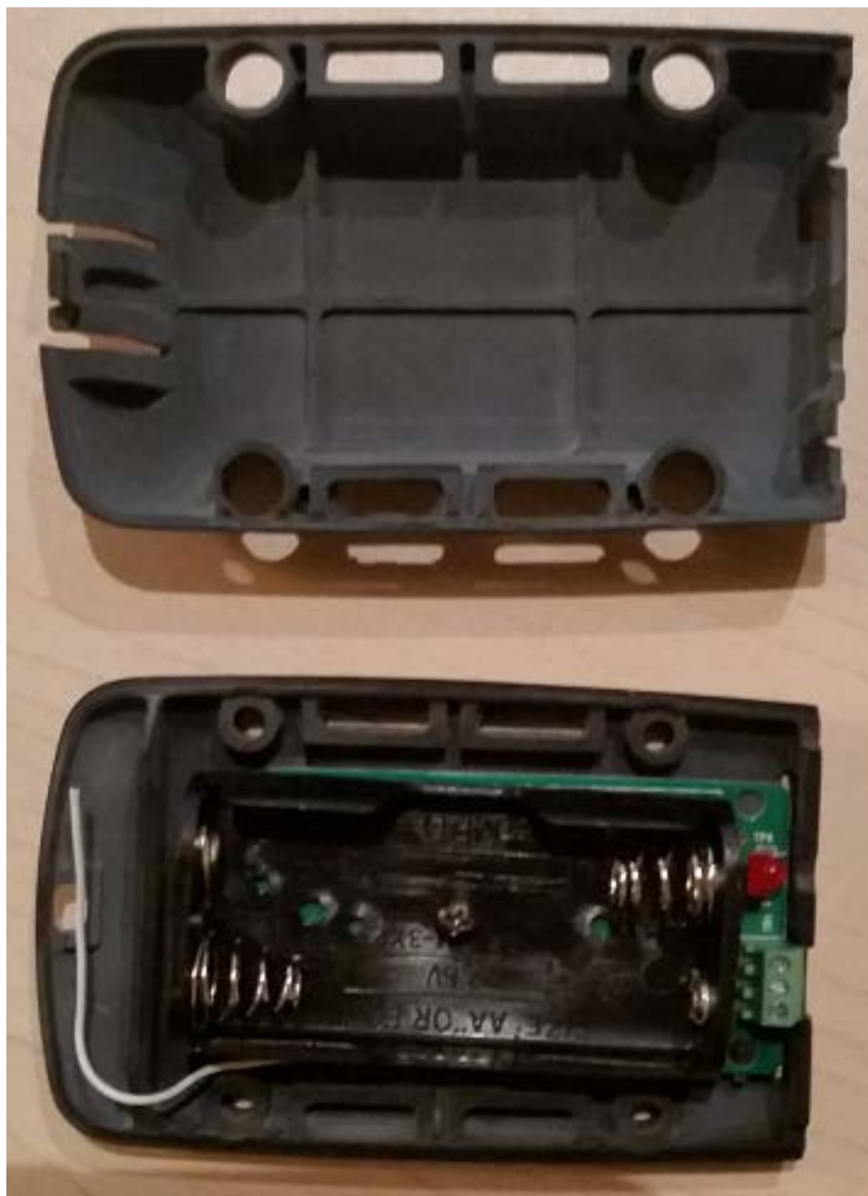
Fig 1. Product with battery cover removed.