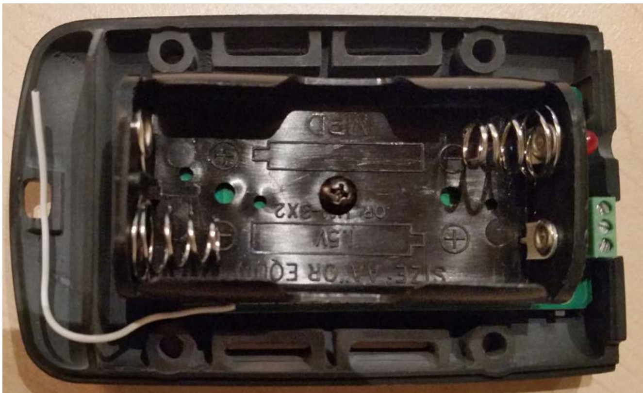
Fig 3. Close up of the Battery Compartment Left-hand side, showing the wire antenna placement.