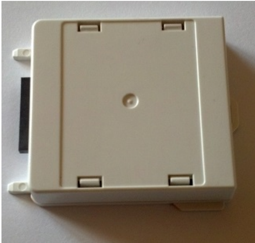
Top Surface, showing host interface to the left.