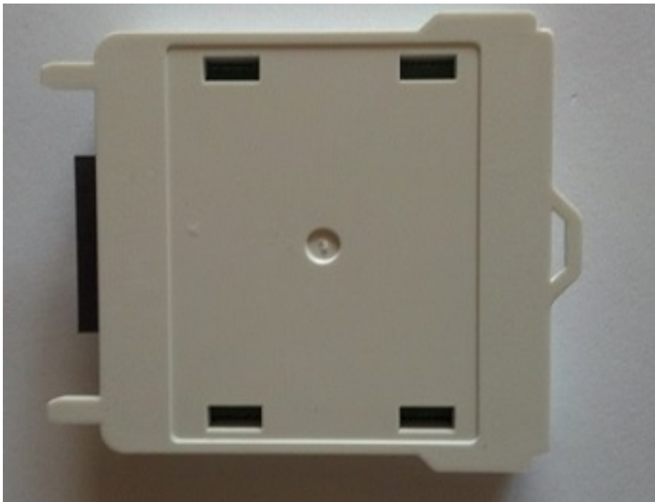
Bottom Surface, showing host interface to the left