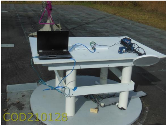
30MHz to 1000MHz Initial Setup with PC