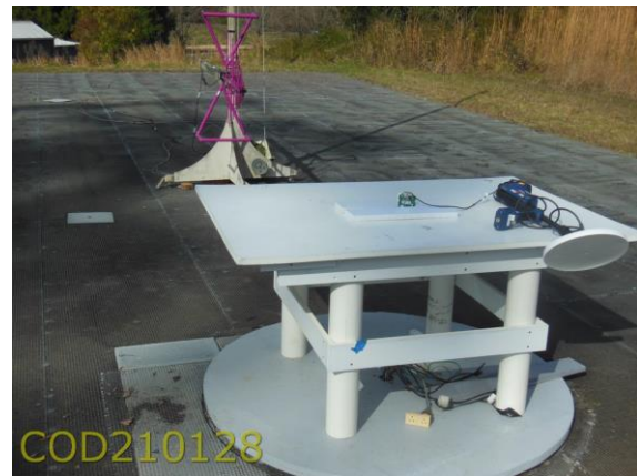
30MHz to 1GHz Final with EUT and Host