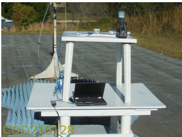
>1GHz Radiated View 1