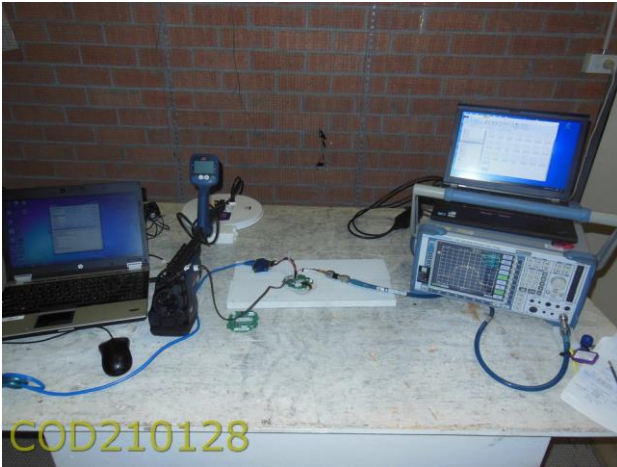
View Bench Test RF Port Conducted