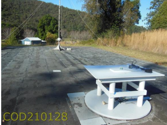
9kHz to 30MHz, Over GP