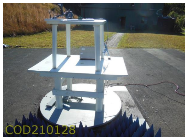
>1GHz View 2

This document shall not be reproduced, except in full