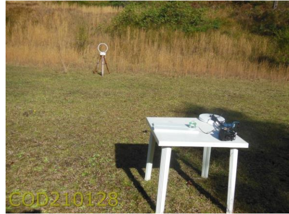
9kHz to 30MHz, No GP