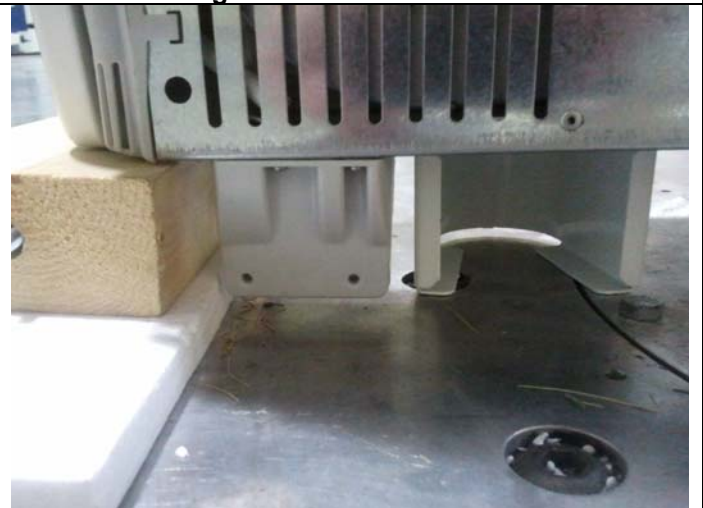
Fig 4 Transceiver fitted