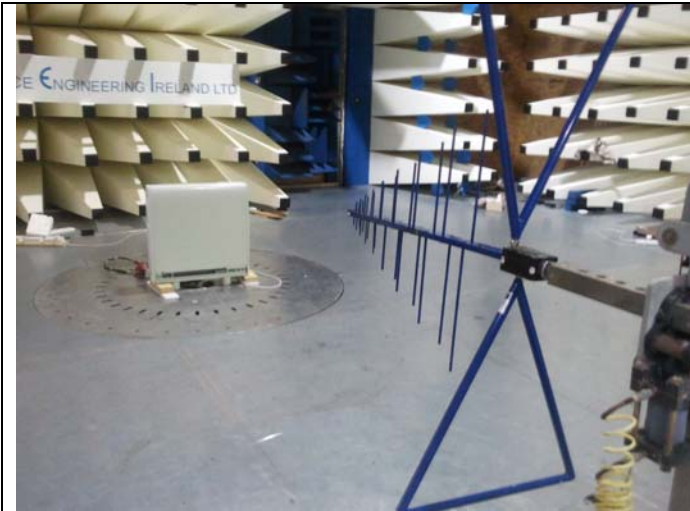
Fig 1 Radiated Emissions -