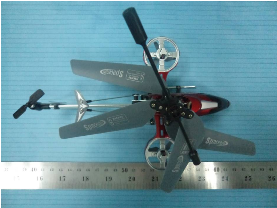
EUT – Bottom View (Red)