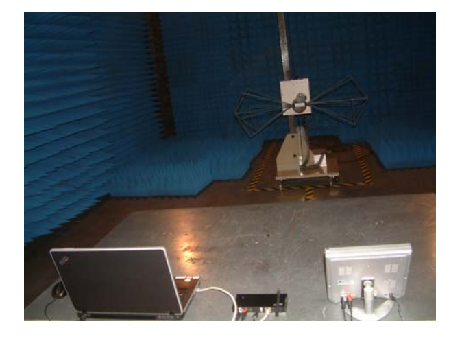
RE Below 1GHz-2