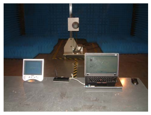
RE Above 1GHz-1