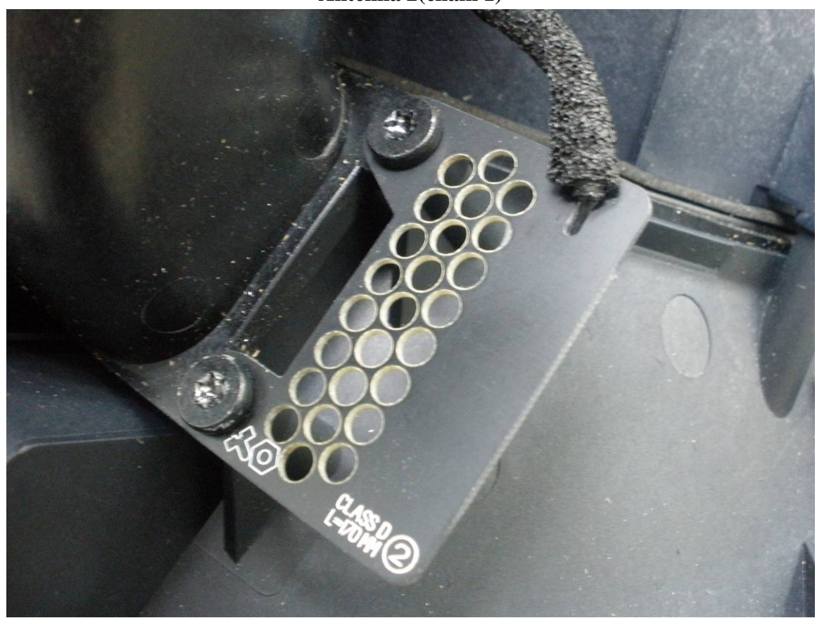
Antenna 2(chain 1)