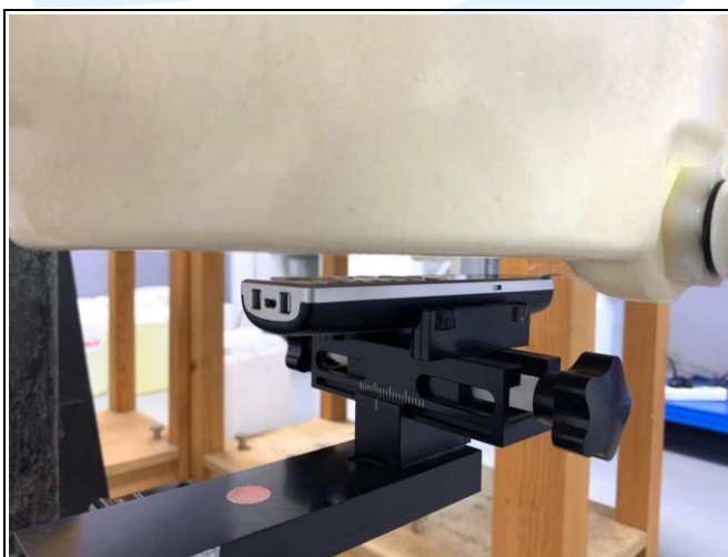
Front Face of EUT with 1.0 cm Gap