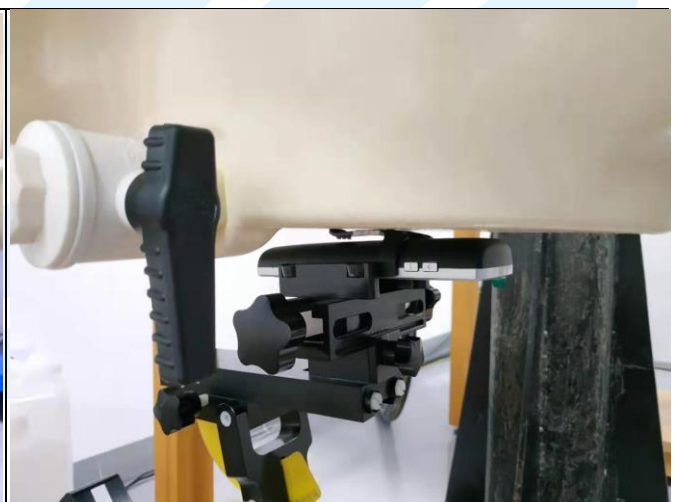
Rear Face of EUT with 0 cm Gap with Belt Clip