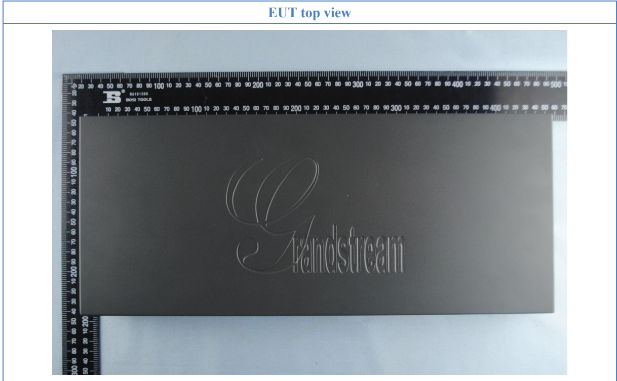
EUT top view