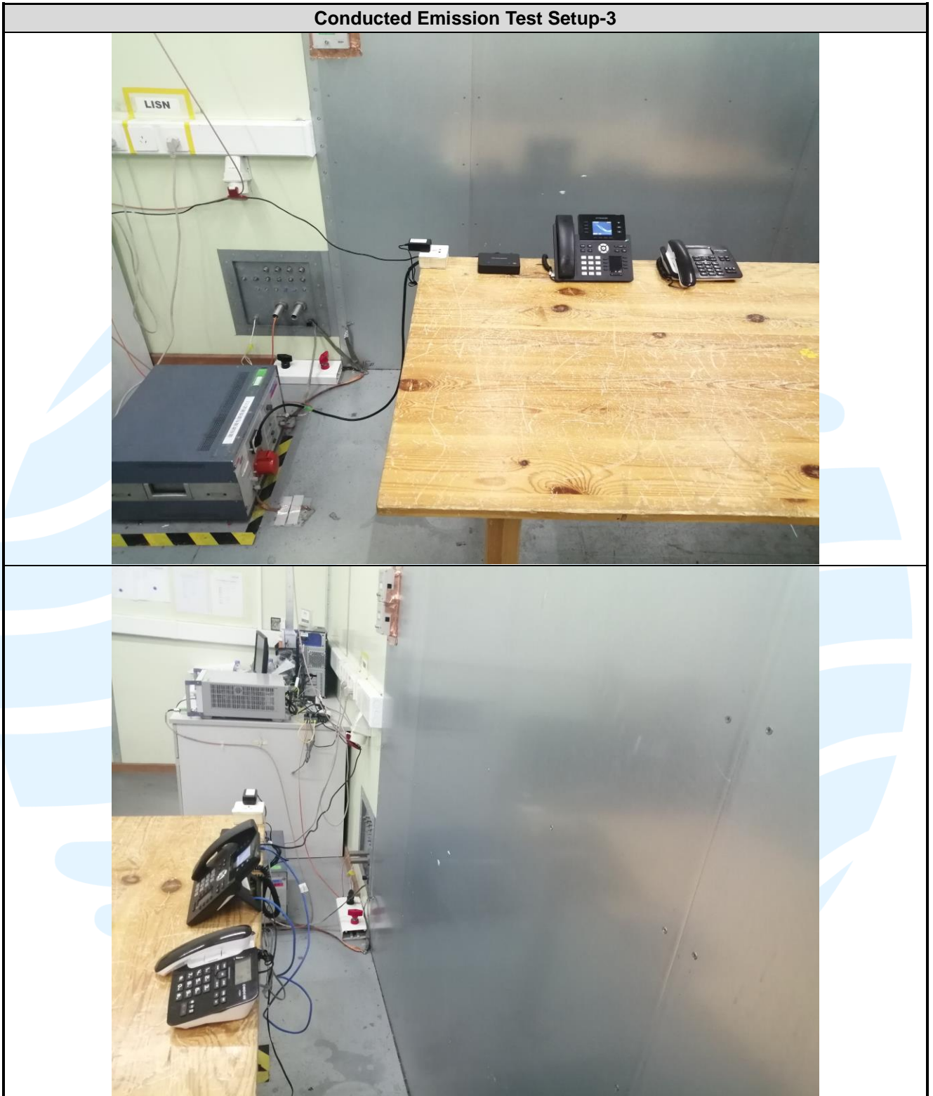
Conducted Emission Test Setup-3