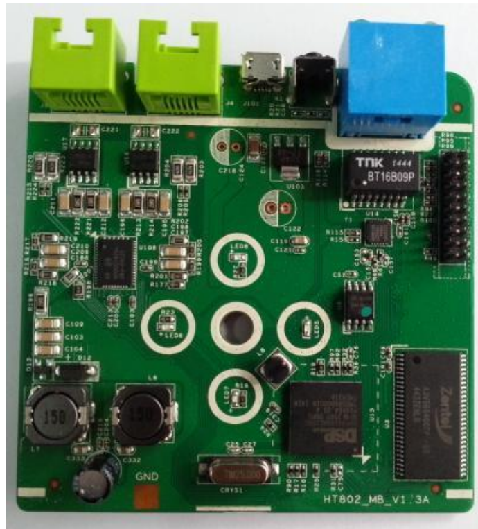
Original PCB Layout view