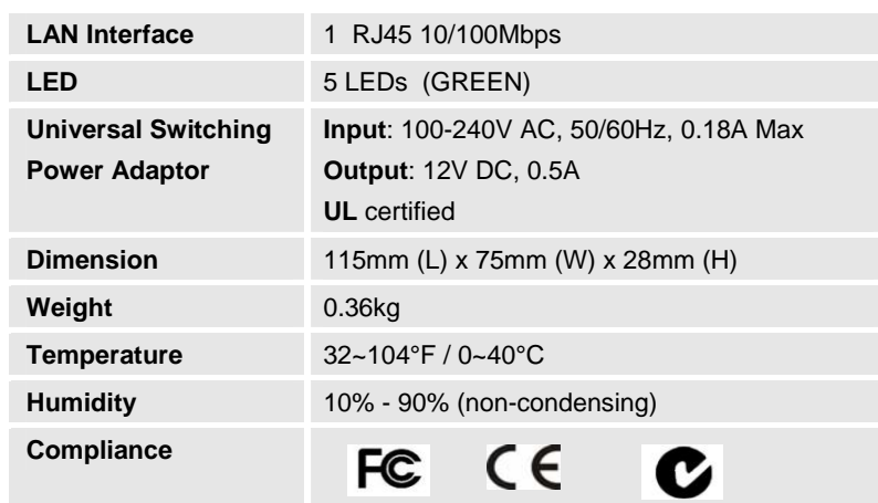
TABLE 5: HT702 HARDWARE SPECIFICATION

The table below lists the hardware specification of HT702.