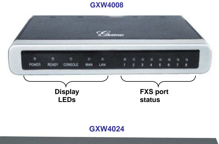
FIGURE 2: DIAGRAM OF GXW4004-8 AND GXW4024 DISPLAY PANEL

Once the GXW40xx is turned on and configured, the front display panel indicates the status of the unit.