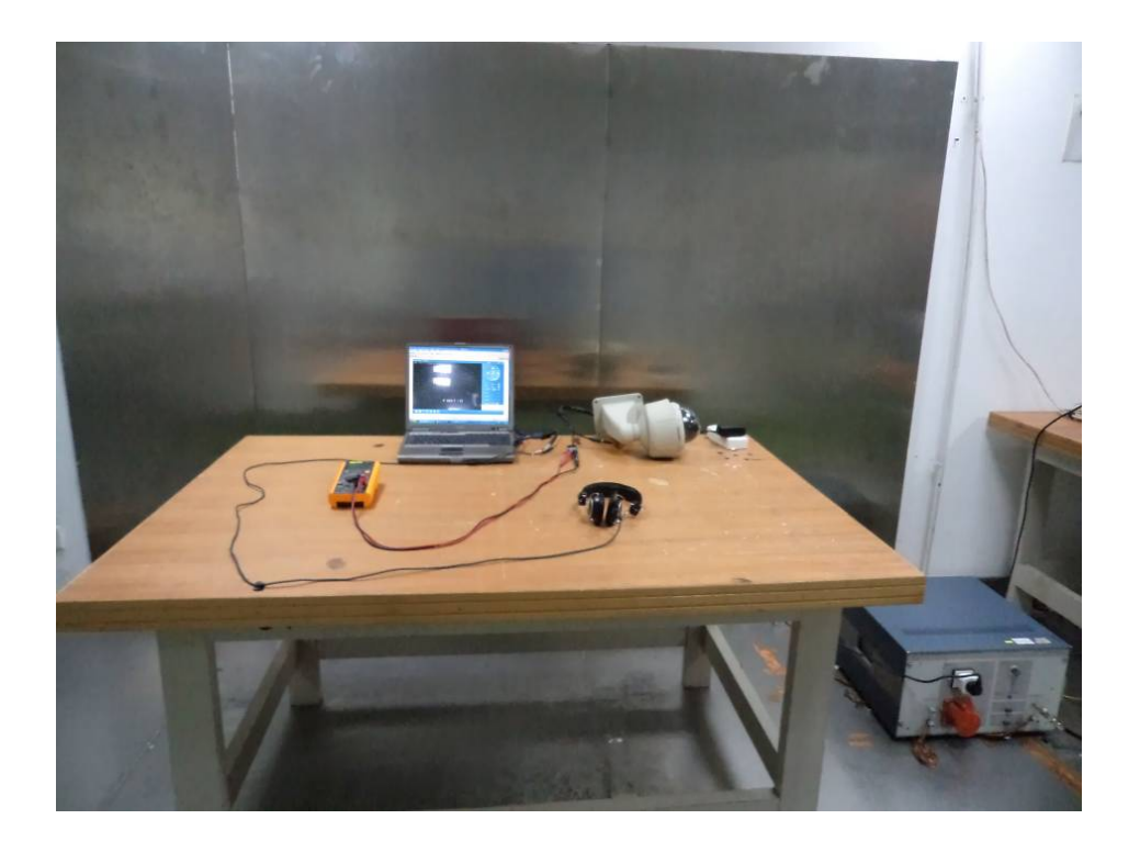
AC Line Conducted Emissions - Side View