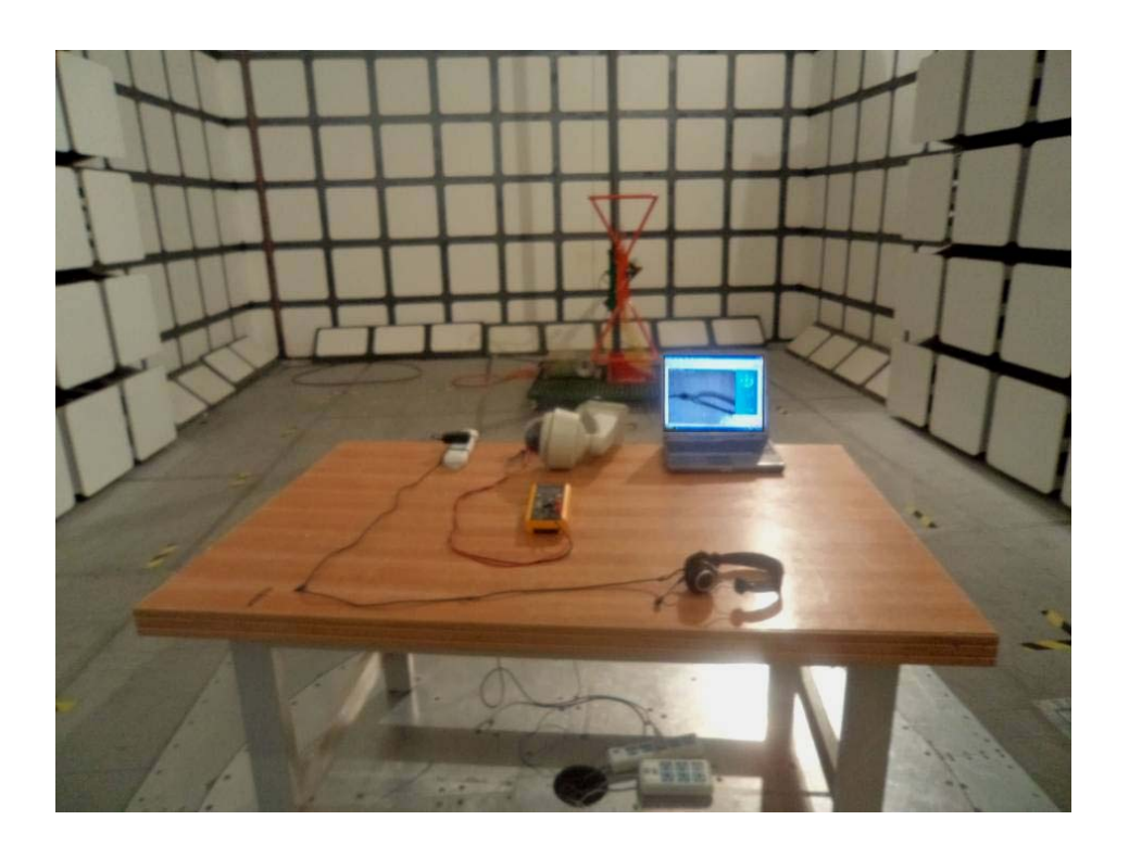
Radiated Emissions - Rear View (Below 1GHz)