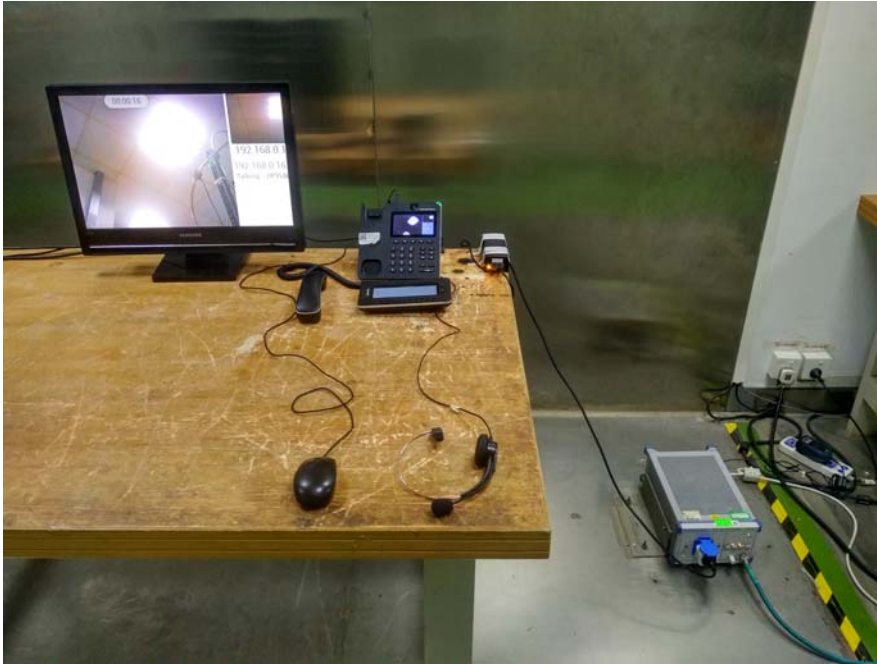
AC Line Conducted Emissions - Side View (Powered by POE)