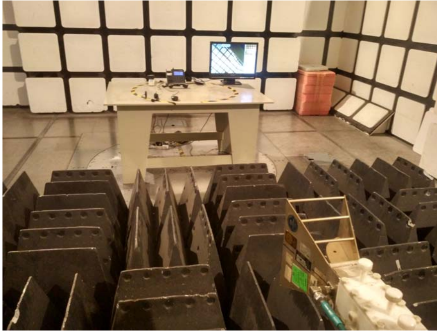
Radiated Emissions - Rear View (Above 1GHz, Powered by Adapter 1)