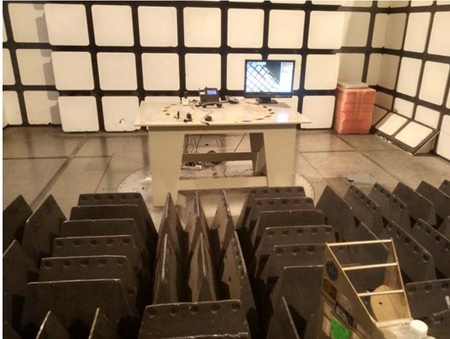
Radiated Emissions - Rear View (Above 1GHz, Powered by Adapter 2)