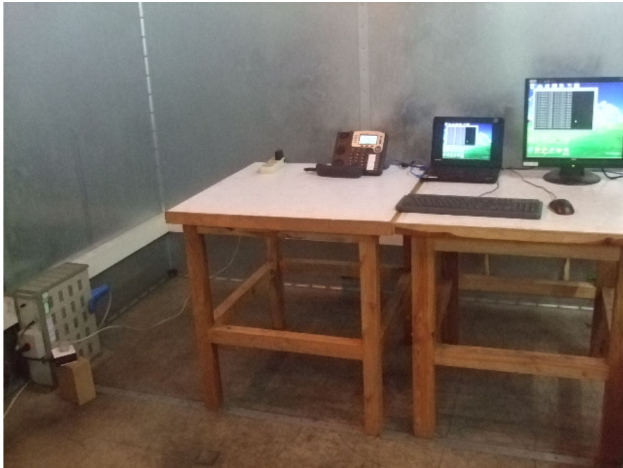
Conducted Emission Test Set-up