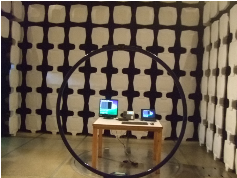
Radiated Emission Test Set-up (9KHz-30MHz)