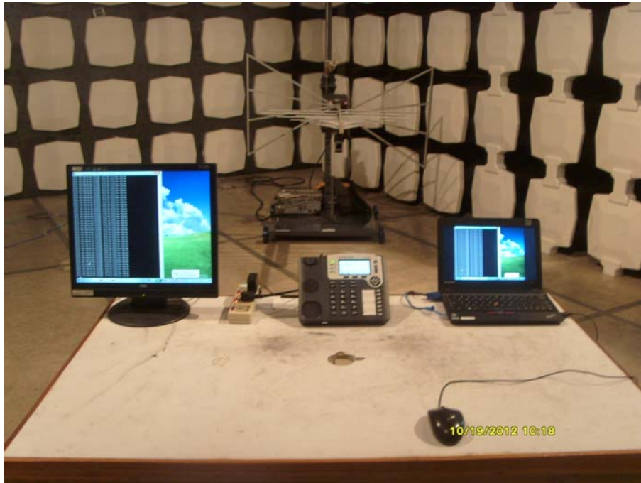
Radiated Emission Test Set-up (Below 1GHz)