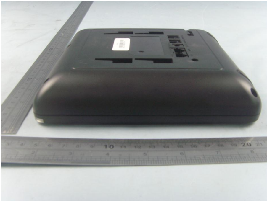
EUT- Right Side View