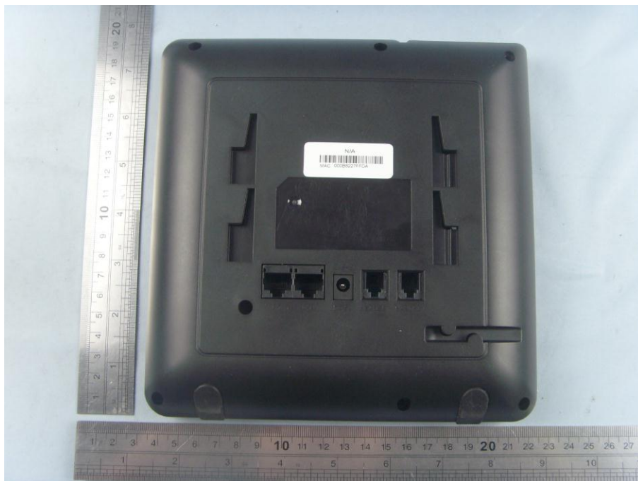
EUT- Rear View