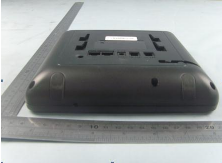
EUT- Bottom View