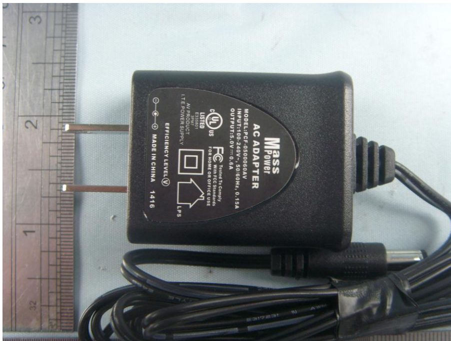
Power Adapter #1 View(Manufacturer: Mass power)