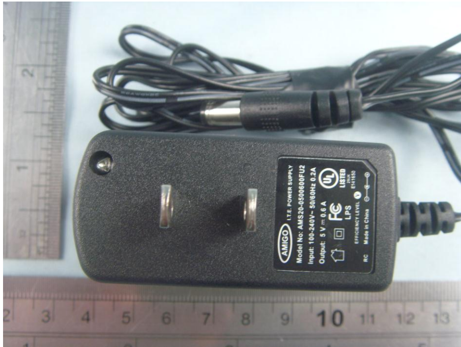
Power Adapter #2 View(Manufacturer: AMIGO)