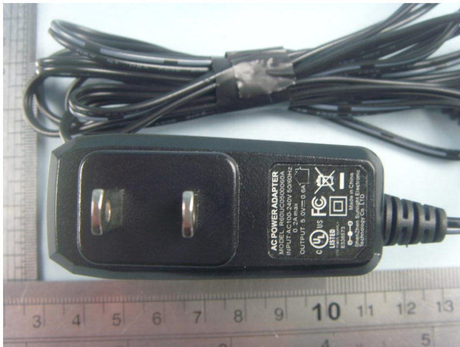
Power Adapter #3 View(Manufacturer: SUNLIGHT)