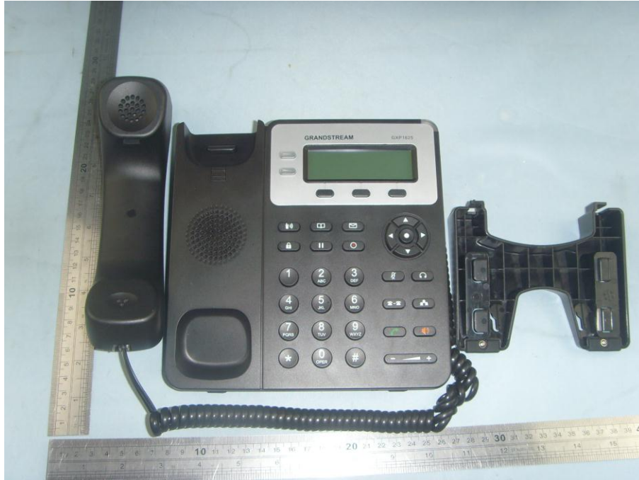
EUT- Full View