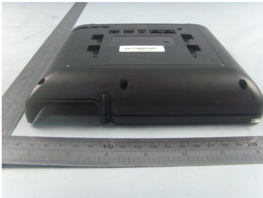
EUT- Top View