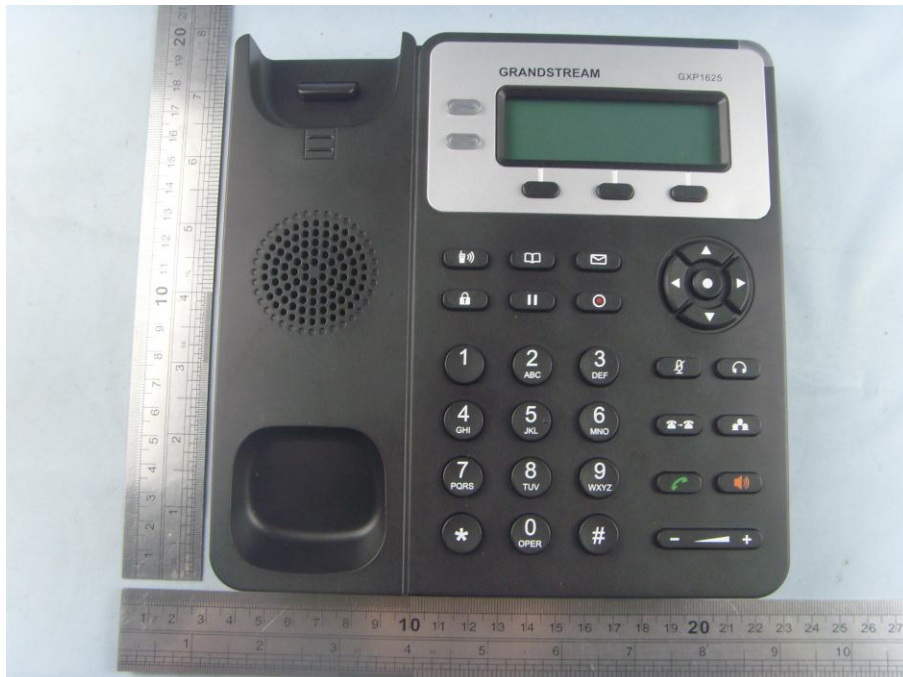
EUT- Front View